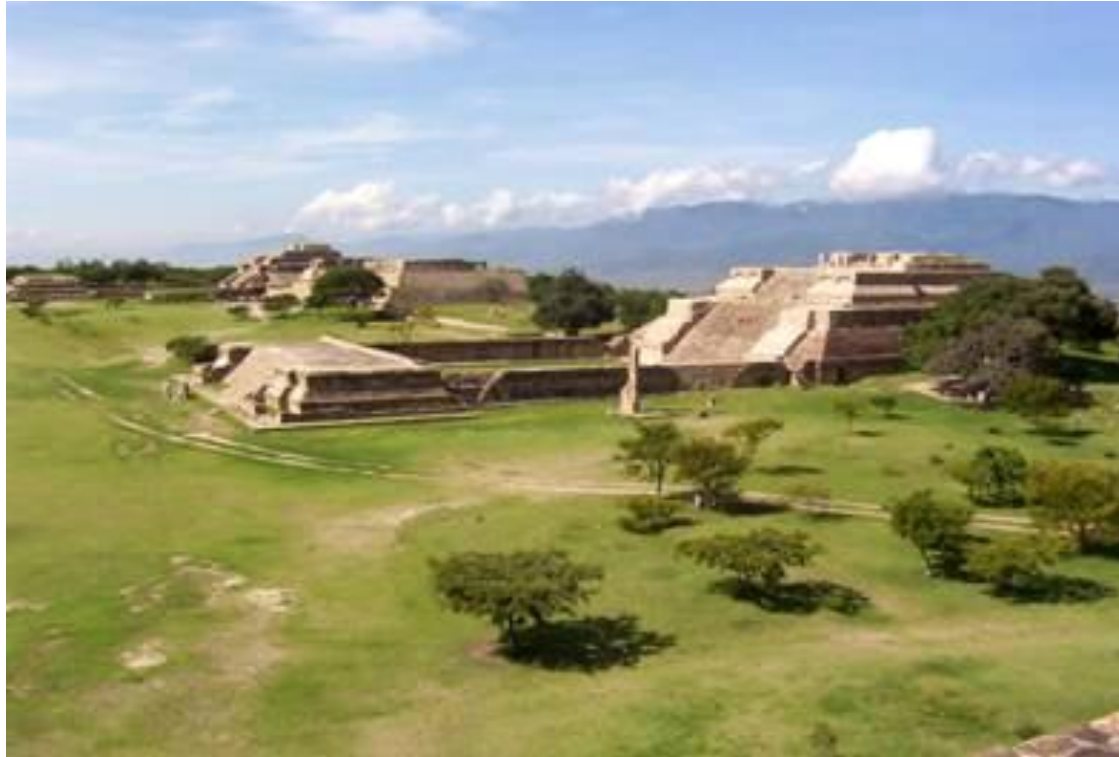
View of the System IV, Main Square.