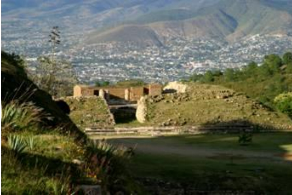
View of the X Building, Northwest end of the North Platform.