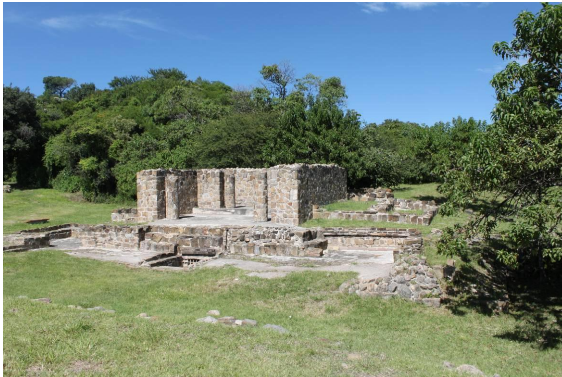
Panoramic of Tomb 7 of Monte Albán: Archive of the Archaeological Site of Monte Albán: Photography: Miguel Angel Cruz González, INAH, 2011.

Finally, please provide us, if possible, with up to ten images of the concerned World Heritage property that can be used free of rights in UNESCO publications (commercial and/or non-commercial), and on the UNESCO website. Please provide the name of the photographer and the caption along with the images (he/she will be credited for any use of the images).