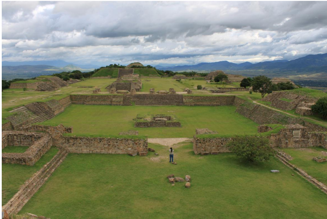
View of the Sunken Patio, North Platform and Main Square. Archive of the Archaeological Site of Monte Albán: 2011.