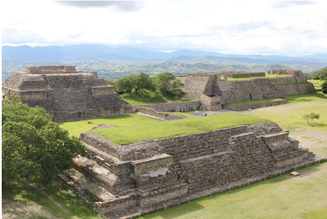
General view of the M System and L Building (Dancers). Archive of the Archaeological Site of Monte Albán: Photography: Miguel Angel Cruz González, INAH: 2011.