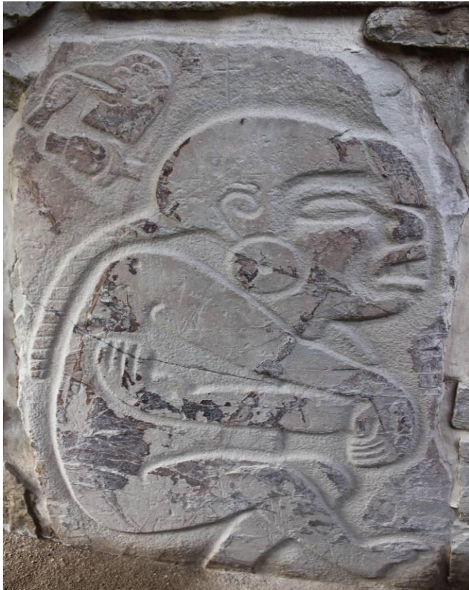
Dancer sculpture (L Building-Gallery of Dancers).