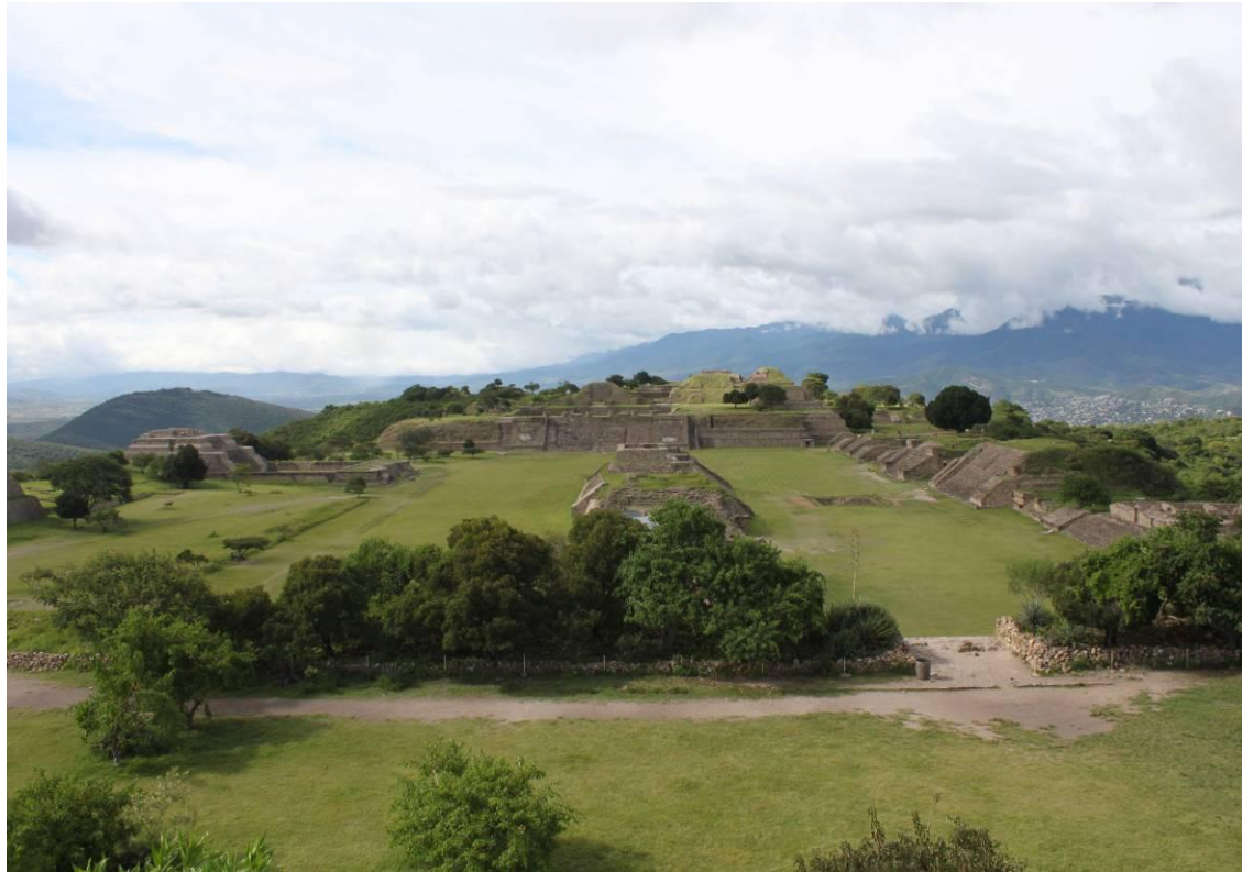
Panoramic from the South of the Main Square of Monte Albán. Archive of the Archaeological Site of Monte Albán: Photography: Miguel Angel Cruz González, INAH: 2011.