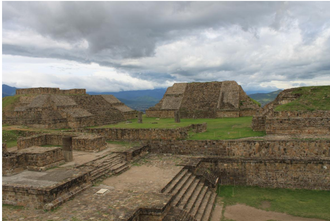
View of the VG Group, North Platform.