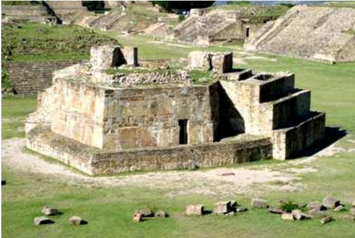
View of the J Building (Observatory), Main Square.