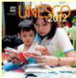
A title page of the UNESCO 2012 Annual Report.

The Annual Report of UNESCO is sampling some of the last year's highlights. Divided into 8 Chapters, the Annual Report covers issues such as: Education for the 21st Century, Science for a Sustainable Future, One Planet, One Ocean, Defending Freedom of Expression and others while each chapter describes several specific UNESCO and its partners' projects devoted to