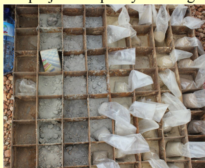
Fragments collected from various depths along the Garasley borehole.

The mission to Jijiga in Somali Region was carried out to monitor drilling of Garasley borehole. The drilling is one of activities under Flemish project “Capacity building and groundwater