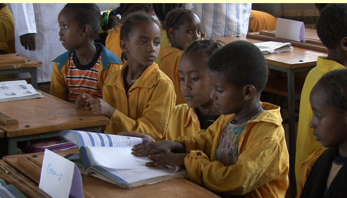
Students in one of the visited primary schools.

Monitoring and evaluation of the overall intervention of the USAID projects through its implementing partners in the Diredawa City Administration and Harar Regional States of Ethiopia was also on the agenda. Six primary schools and one teachers college were visited by the participants.