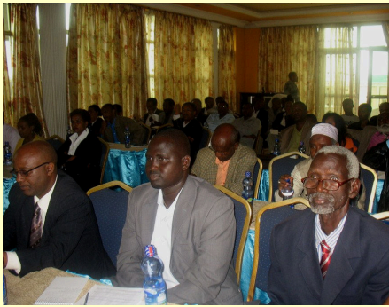
Participants of the conference.

The conference was organized under a theme, “The Contribution of Culture for development: A Challenge of Today’s Ethiopia”. The workshop was attended by almost 60 relevant stakeholders from the