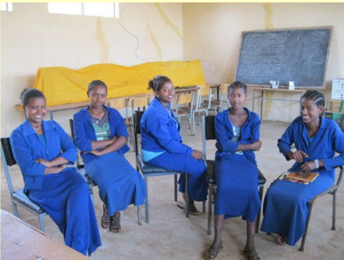
Members of the Girls' Club in Manbuk Secondary School.

"We discussed with the school principals, teachers, girls and members of the Parent-Teacher Association (PTA) and we found out that the trend of girls' enrollment has been improving in these target schools despite the socio-cultural issues such