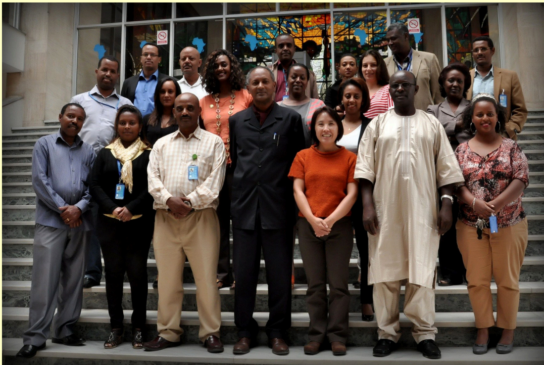
UNESCO staff of Addis Ababa Liaison Office.