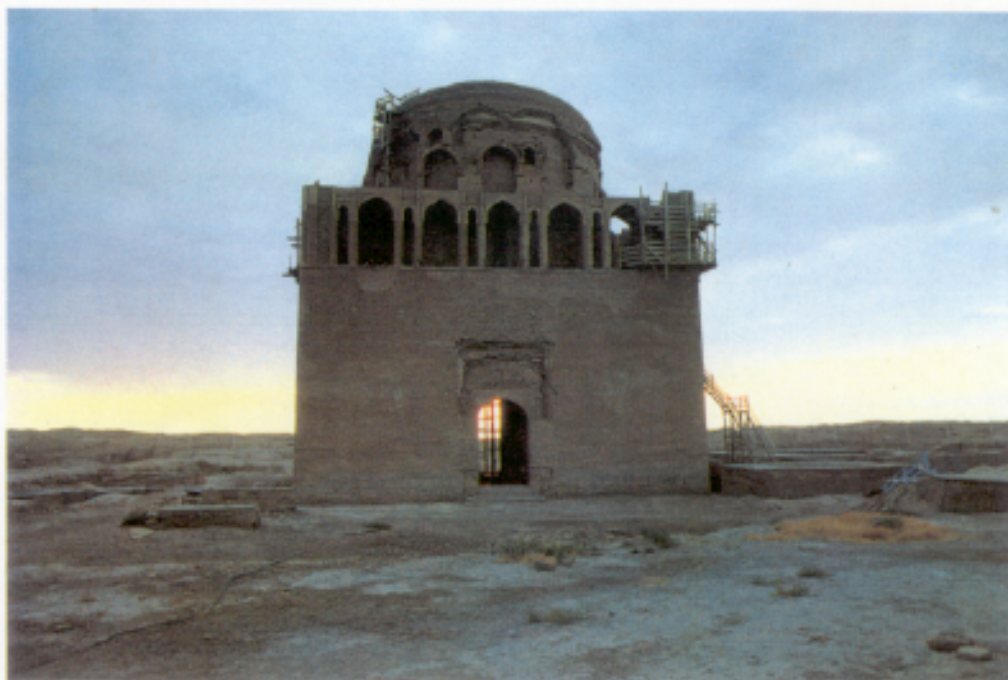
The Mausoleum of Sultan Sanjar, Archaeological Park 'Ancient Merv'