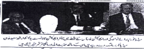
وزیر تعلیم نواز شریف نے ایک اجلاس میں مختلف اداروں کے سربراہان سے تعلیم کے شعبے کی ترقی کے بارے میں گفتگو کی۔