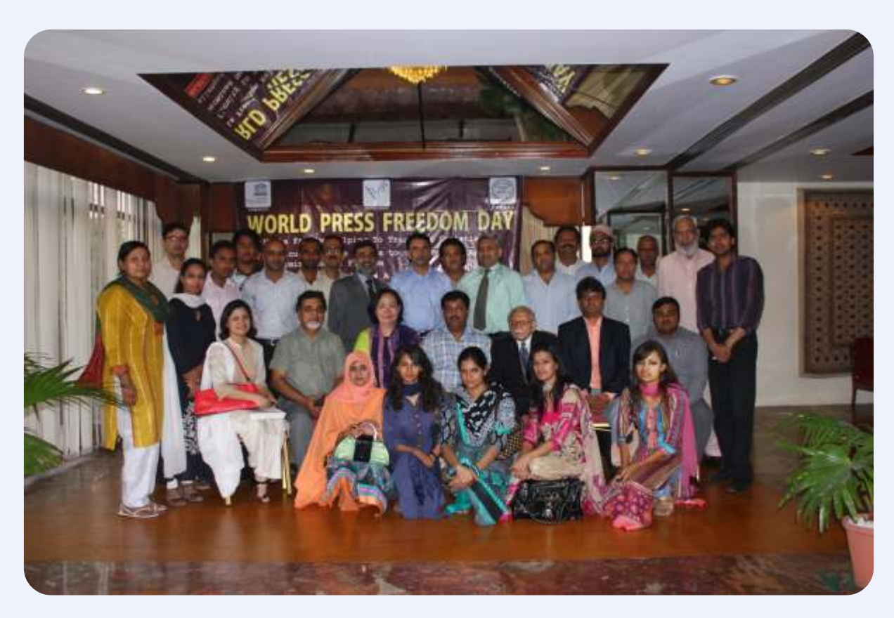
Director UNESCO with a group meeting of participants