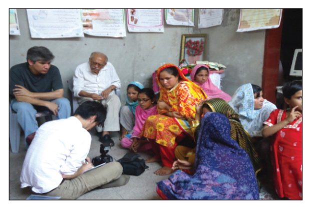
At Dograikalan CLC