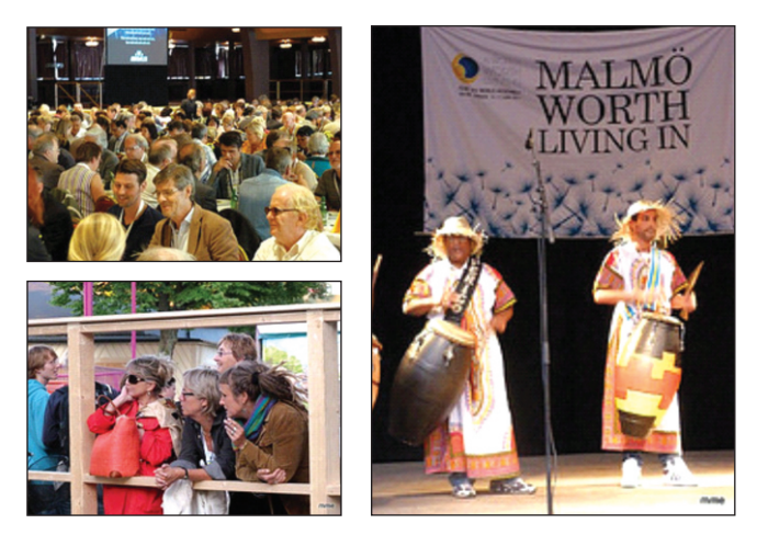
ICAE world assembly, Sweden

Recognizing the political underpinnings of education is central for bringing about the change we envisage. ICAE and sister social movements and organizations act in defense and promotion of adult learning and education in the perspective of political and social transformation. We place at the heart of our debate and action the fostering of critical thinking, of learning in dialogue with one another, the reading of the world in order to change it. It is inspired in the richness of our collective experience, with what we have learnt with popular education, feminist education, folkbildning, and so many other experiences, that we move forward the struggle for the right to adult learning and education. It is with this understanding and accumulated experience that we demand from the States, from international organizations and other policy makers, appropriate measurers towards social, environmental, economic and gender justice and within this, the right for adult learning and education.