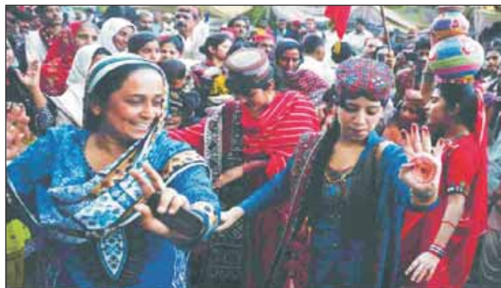
WEARING the traditional Topi and Ajrak, women and young girls celebrate Sindh Culture Day on Friday. Related report on Page 18

They believed that the organized presence of these parties in such numbers made one wonder if the culture day was a sincere expression of love for the culture of Sindh or a contest among these parties vying to flaunt their love for the soil of Sindh.