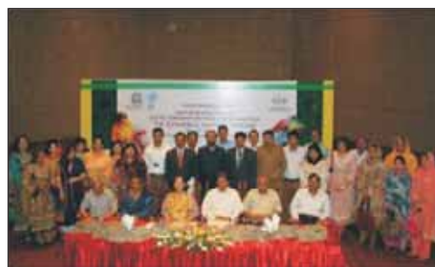
Opening Ceremony of the Training

This training workshop was continued for 4 days and relevant staff from Department of Culture, Government of Punjab and staff from Culture Departments of other provinces including Khyber Pakhtun Khwa, Baluchistan, Azad Jammu & Kashmir and Sindh attended the workshop. The workshop focused on understanding the 2003 convention, its implementation and how to benefit from the mechanism of international cooperation established by the convention.