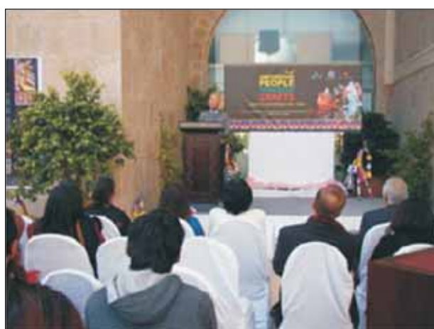
HE Cecile Landsverk (Ms) Ambassador of Norway

The project was carried out in two villages in the outskirts of Bahawalpur City of BC 33 and Dingarh, which is the drought-affected area of Cholistan Desert, where 150 women have been engaged through capacity building in the crafts making and focused on providing opportunities for income generation and decent livelihoods.