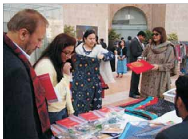
Products made by Artisans of Bahawalpur being purchased by the visitors at Serena Business Complex