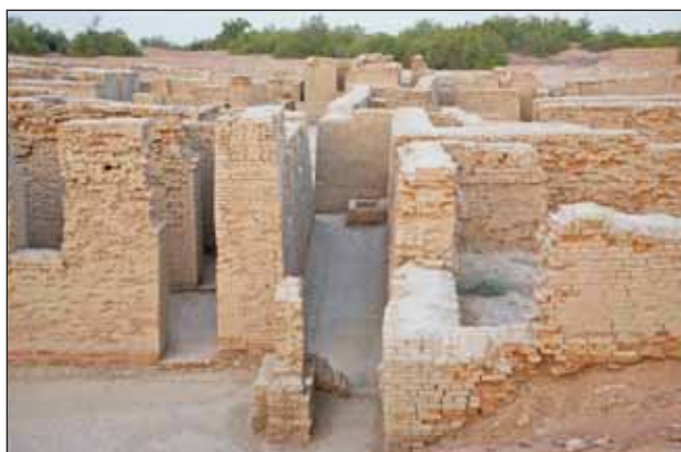
Archaeological Sites at Moenjodaro

The culture sector, encompassing cultural heritage, creative and cultural industries, cultural tourism and cultural infrastructure, generates substantial economic benefits, including job creation. Despite the lack of reliable and consolidated data on the socio-economic contribution of culture, cultural industries account for more than 3.4 per cent of the global gross domestic product, with a global market share of approximately 1.6 trillion United States dollars in 2007, which represents almost double the amount estimated for international tourism receipts for the same year, according to a report carried out by PricewaterhouseCoopers in 2008. As outlined in the same report, cultural and creative industries represent one of the most rapidly expanding sectors in the global economy, with a growth rate of 17.6 per cent in the Middle East, 13.9 per cent in Africa, 11.9 per cent in South America, 9.7 per cent in Asia, 6.9 per cent in Oceania, and 4.3 per cent in North and Central America. The report also records how the culture sector grew steadily in the 1980s and exponentially in the 1990s, when the creative economies in the member countries of the Organization for Economic Cooperation and Development grew at an annual rate twice that of service industries and four times that of manufacturing.