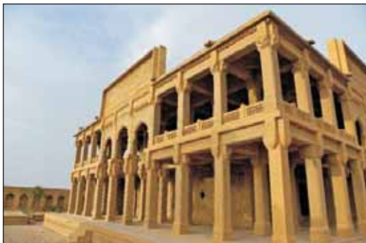
Makli Hill: Tomb of Issa Khan Tharkhan II