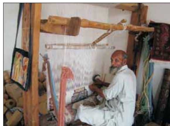
Artisans in Multan