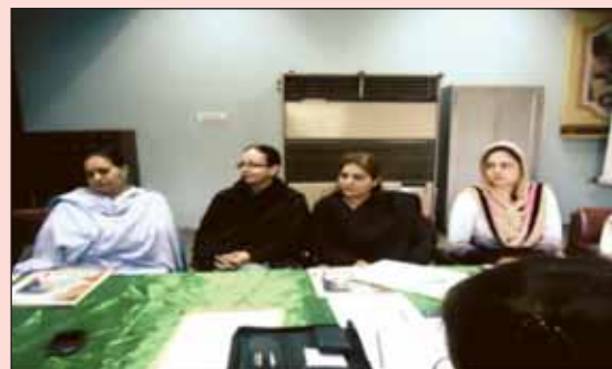
A Scene from The Literacy Forum Meeting