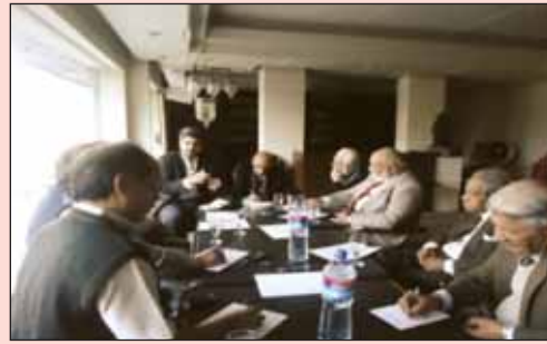
Scene from Civic Forum Meeting