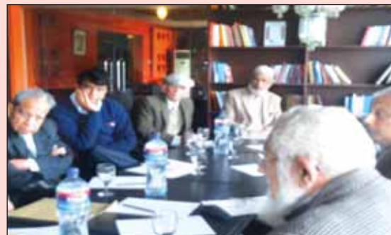
Scene from PACADE Annual General Body Meeting