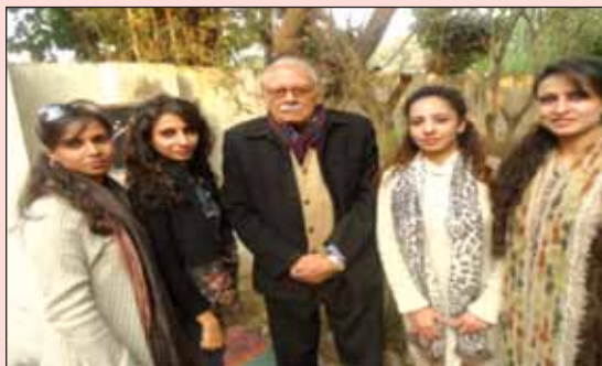
Chairman PACADE with Volunteers