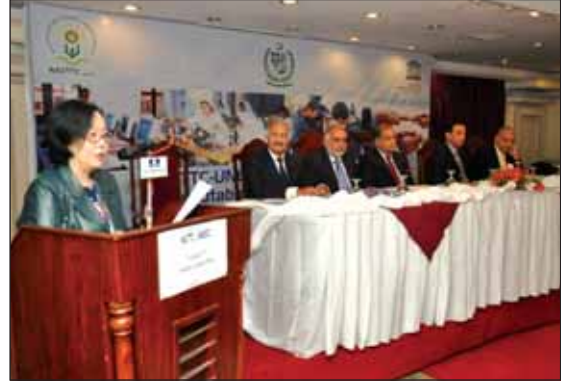
Pre-Roundtable Consultative Meeting

Pakistan is known to be a country of young people as 60% population is below 25 years of age. However, the bitter reality is that the youth cohort completing secondary education is merely 16.3 percent, which obviously suggests that a vast majority of school leavers lack basic life skills necessary for maintaining a decent livelihood. Unless their educational and life skills needs are met attaining the country's economic development goals will remain extremely challenging. Therefore, a sustainable delivery of quality Technical and Vocational Education and Training (TVET) is a critically important aspect of Pakistan education system.