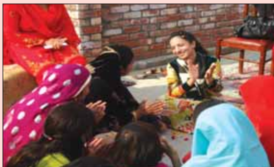
Coordinator at a CL Centre