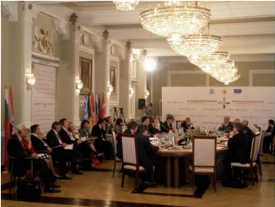
The Cetinje Summit of Heads of State of South-East Europe