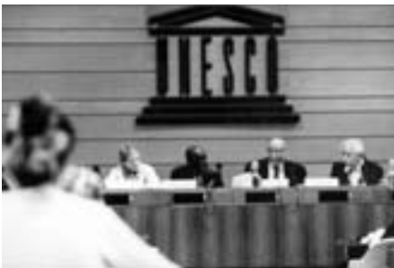
Launching of the interregional philosophical dialogue between Asia and the Arab world. UNESCO Headquarters, Paris 16 and 17 November 2004.

In accordance with the purpose of the Intersectoral Strategy on Philosophy, the inter-regional philosophical dialogues will continue between the other different parts of the world, always in accordance with the following principle: to create ties between philosophers in the areas where these still do not exist, and to reinforce the already existing ones.