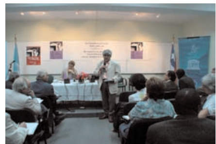
Launching of the interregional philosophical dialogue between Africa and Latin America UNESCO Office in Santiago (Chile) 24 November 2005.