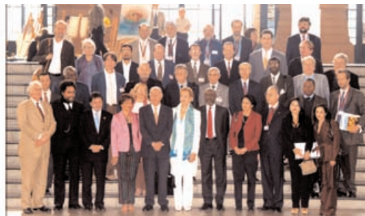
Opening ceremony of the World Philosophy Day in Santiago, (Chile), which took place on 24 November 2005 in the presence of Mr Ricardo Lagos Escobar, President of the Chilean Republic.