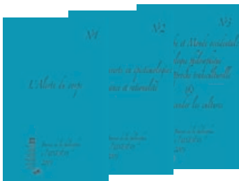
Proceedings of the World Philosophy Day, 20 November 2003 Series of 7 booklets (2005)