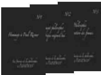
Proceedings of the World Philosophy Day, 18 November 2004 Series of 10 booklets (2006)

Popularization of philosophy is essential in developing a democratic and peaceful culture. Linking the knowledge generated in philosophy and fostering independent thought in the minds of the general public is crucial to peace, especially in countries where philosophy is not yet formally taught. Special emphasis will be put on the translation of philosophical works.