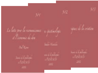
Proceedings of the World Philosophy Day, 21 November 2002 Series of 11 booklets (2004)