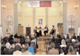
XIIIth International Philosophy Olympiads (IPO) Warsaw (Poland) 19 – 23 May 2005