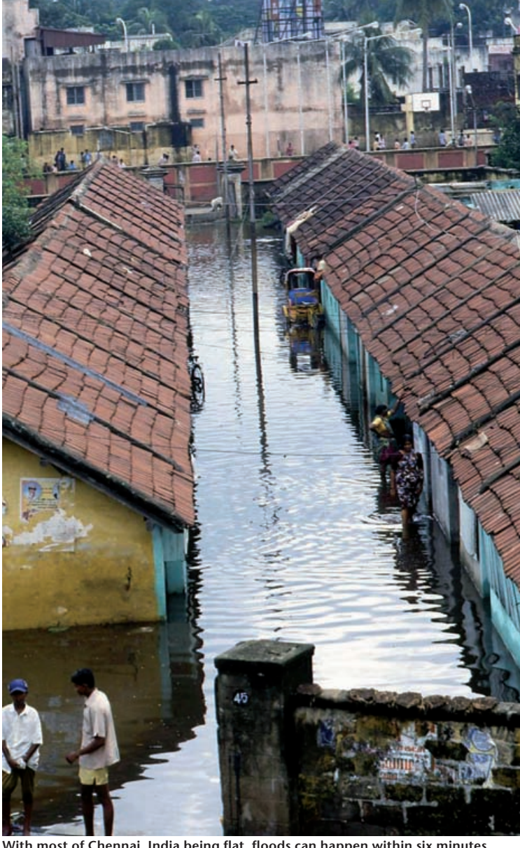
With most of Chennai, India being flat, floods can happen within six minutes from the start of a sustained burst of rain.