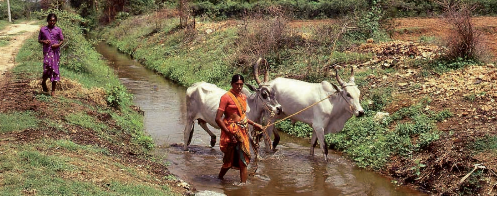
Steadily growing in population, the state of Tamil Nadu in India faces growing shortages of potable water.