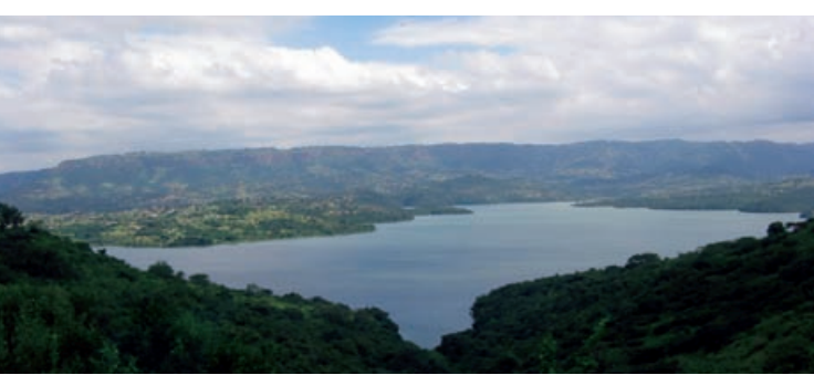
River Basin South Africa.

The approach followed by the teams in the process of developing the different NAPAs is guided by some basic principles, including that the process 'should have a country-driven approach and be a participatory process involving multi-stakeholder consultation, reflecting a true bottom-up approach'. In addition, the process should involve a multidisciplinary group of experts, and undertake comprehensive and integrated assessments and it should