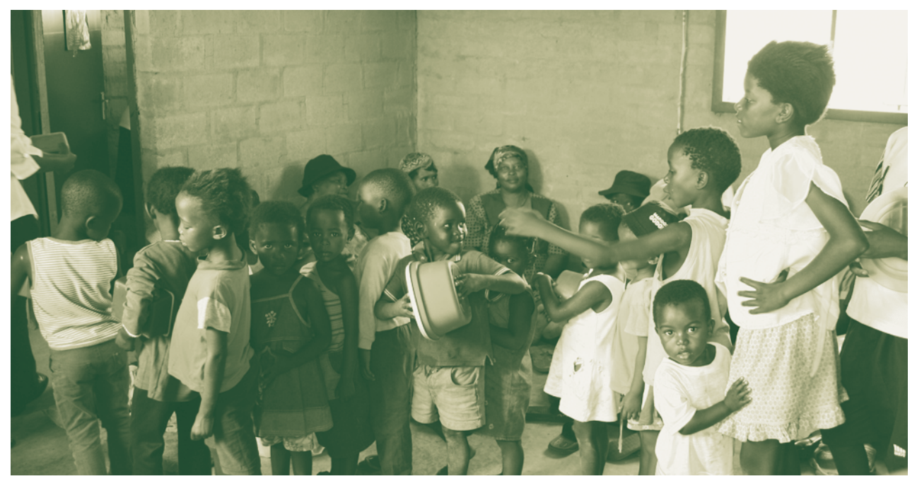
Programmes providing nutritional support and basic care are important for the well-being of children affected by AIDS.

Sustainable feeding schemes should be provided to all schools across vulnerable districts, to guarantee every learner one nutritious meal per day. These should also be accessible to out-of-school children in the district, and used to motivate their (re)enrolment. At the very least, in the event that economic constraints preclude feeding at scale, one meal per day must be guaranteed to those children designated OVC – including HIV-positive learners.