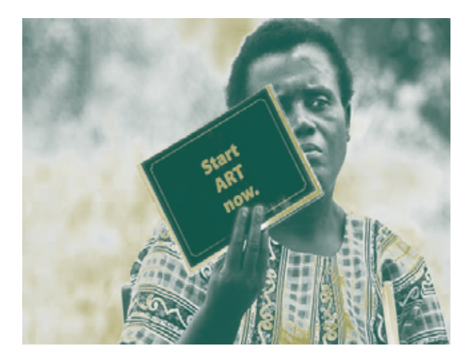
Meeting the testing and treatment needs of children and ensuring "child-friendly" services remains a significant challenge.

The reported failure of the education sectors in Namibia and Tanzania to communicate with and inform their learners of the facts is of great concern. But however culpable these country systems might be, it should also be recognised that a debilitating level of "AIDS fatigue" dogs efforts to develop, communicate and receive such information. In Africa at least, several generations have been weaned on billboards, posters and media reports to the point that such messaging may have become background noise. In such circumstances, criticism is easy and may even be accurate relative to the intake of behaviour-changing knowledge. As one young Namibian remarked: "HIV and AIDS information is given in such a boring way, not appealing to young people. It needs to be youth-friendly, not just topdown from old people."