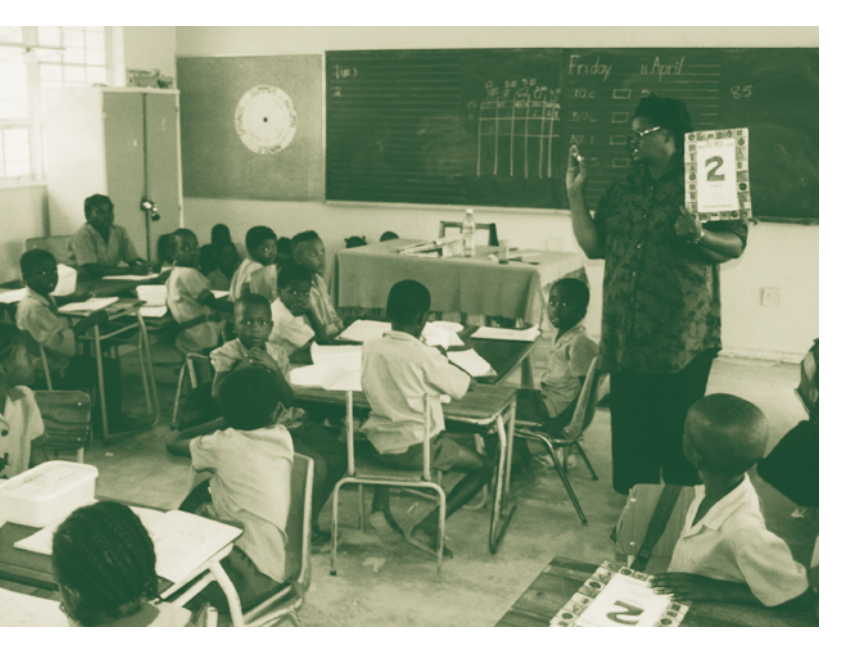
Teacher training, policy guidelines, and efforts to address stigma and discrimination are all part of an enabling school environment for all learners.

Indeed, there is no doubt that policy and guidelines exist, and cover most of the issues that best practice requires. Structures are clearly in place and are increasingly decentralised, with regulated if limited reporting; oversight committees and other meetings are also clearly held, although the frequency and depth of these may be less than desirable. Nevertheless, ministry officials seemed confident that they were on top of the problem and had met all their obligations and responsibilities. Whether these statements are based on assumption, reports or a belief in the unchallengeable primacy of policy is unknown. What is clear is that implementation,