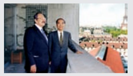
HRH Prince Talal Bin Abdul Aziz Al-Saud and Mr Koïchiro Matsuura at UNESCO Headquarters

Contributions in 2007 to UNESCO projects by AGFUND, presided by HRH Prince Talal Bin Abdul Aziz, UNESCO Special Envoy for Water