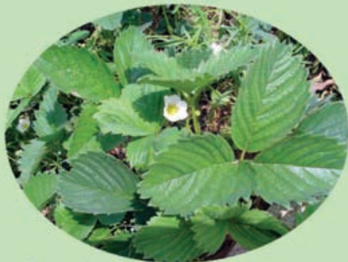
Fragaria chiloensis var. ananassa