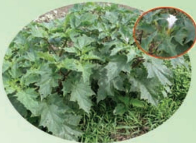
Datura stramonium var. chalybea