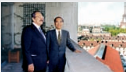
HRH Prince Talal Bin Abdul Aziz Al-Saud and Mr Koichiro Matsuura at UNESCO Headquarters

In 2007, the Arab Gulf Programme for United Nations Development Organizations (AGFUND) donated US$ 125,000 for the co-financing of the UNESCO project entitled "Training of Teachers and Enhancing Educational Opportunities of Learners with Special Needs in Eritrea".