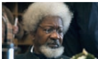
Mr Wole Soyinka, UNESCO Goodwill Ambassador

Her Highness Sheikha Mozah Bint Nasser Al-Missned, UNESCO Special Envoy for Basic and Higher Education, and Mr Wole Soyinka, Nobel Prize Laureate in Literature and UNESCO Goodwill Ambassador, participated along with UNESCO Director-