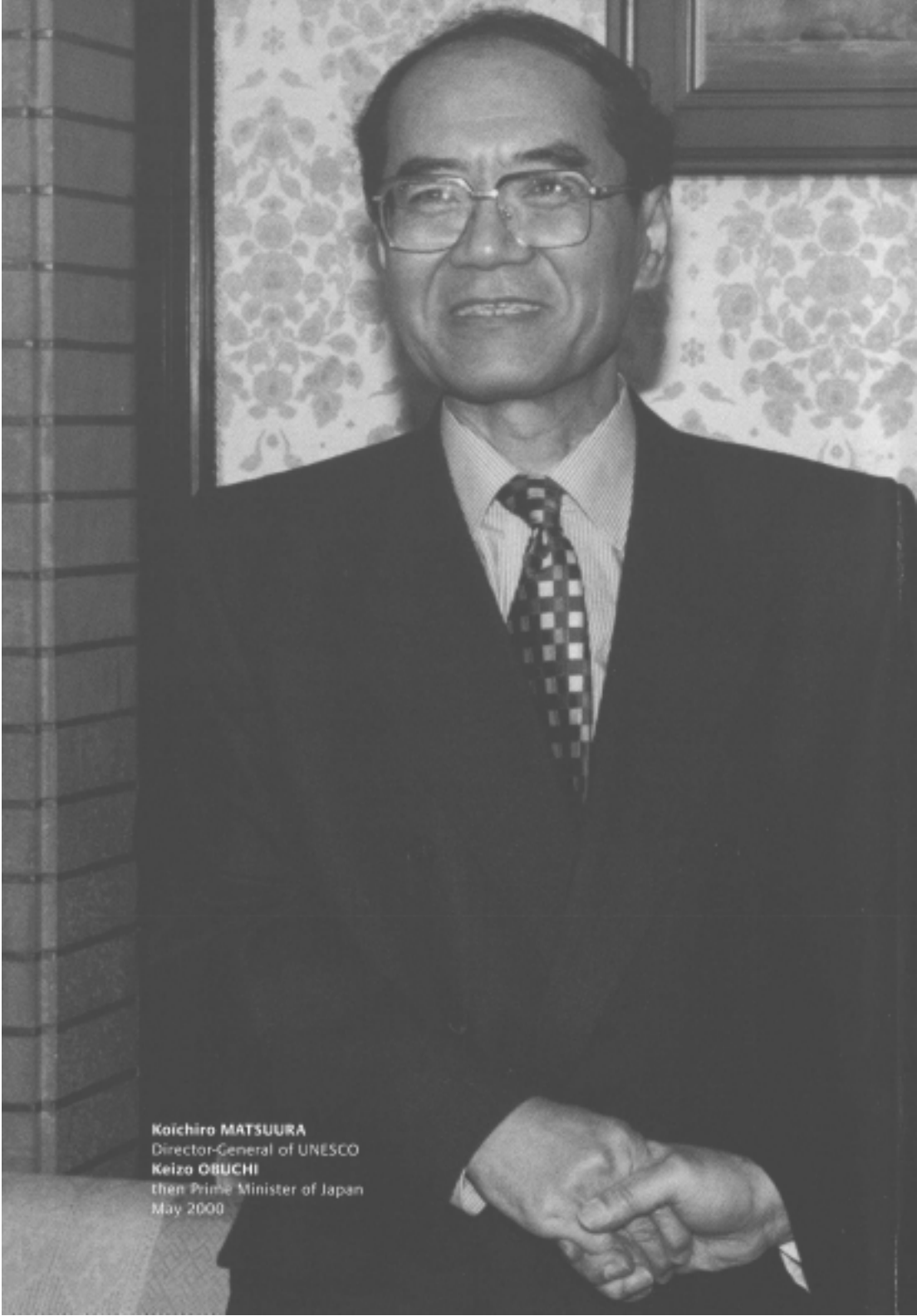
Koichiro MATSUURA Director-General of UNESCO Keizo OBUCHI then Prime Minister of Japan May 2000