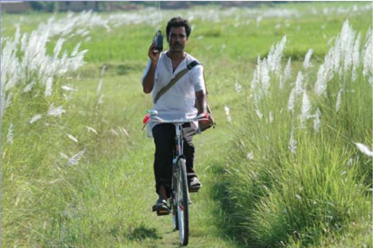
Radio Rep Cycling and listening to a community radio programme at the same time

As regards thematic areas of intervention, UNESCO's action will focus on three main areas of action: Enabling freedom of expression for fostering development, democracy, and dialogue for a culture of peace and nonviolence;