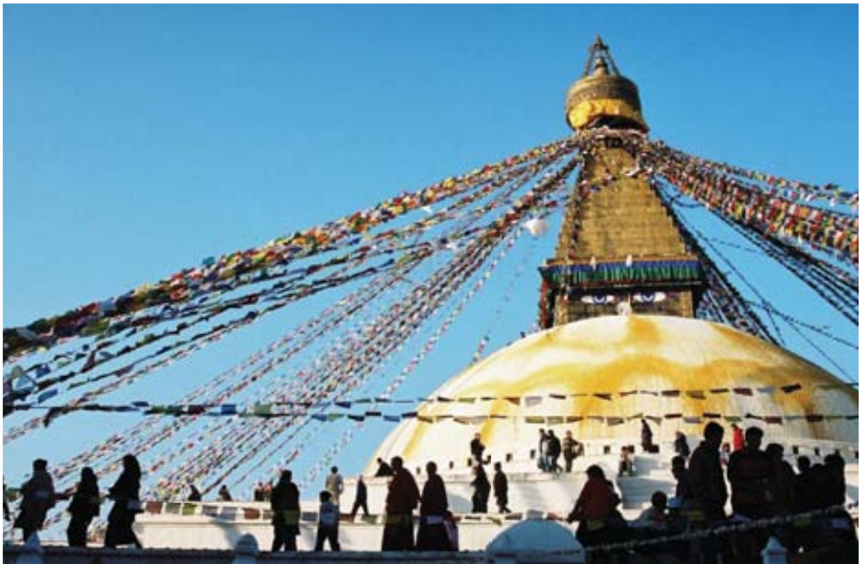
Buddhanath, one of seven monument zones on the Kathmandu Valley World Heritage Property list

Nepal is characterized by a very rich diversity of culture and tangible and intangible heritage. The main features of the country's tangible heritage are the four properties inscribed on the World Heritage List in the categories of world cultural and natural heritage. The two cultural properties are the Kathmandu Valley, with its seven monument zones 29 (1979) and Lumbini, the Birthplace of Lord Buddha (1997). The two natural heritage properties are the Chitwan National Park (1984) and the Sagarmatha National Park (1979). Many other sites included in the Tentative List of World Heritage and those included in the national inventory reflect the rich history of the country.