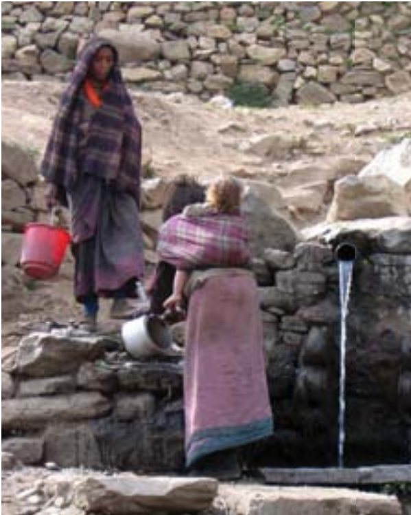
Getting drinking water in Humla