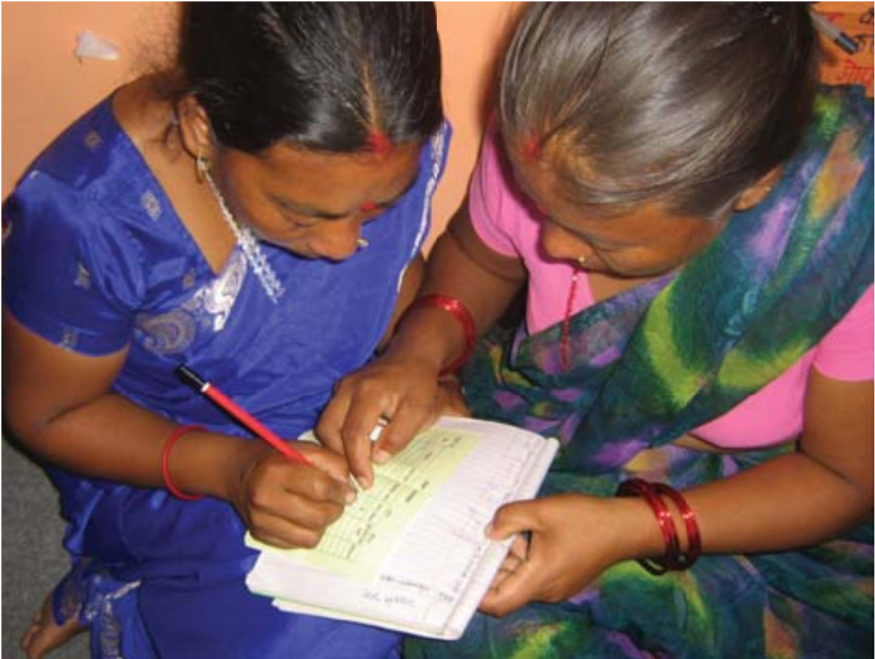
Saving and credit training is a vital component of a literacy programme at Madhawalia Community Learning Centre

Regarding higher education, UNESCO supported national efforts to develop a comprehensive policy. In addition, UNESCO provided support in undertaking research on “Advancing Policy Options for Higher Education: Improving Transition and Access to Higher Education in Nepal” and contributed in capacity development of MoE officials and university teachers with a particular focus on scientific research and innovation.