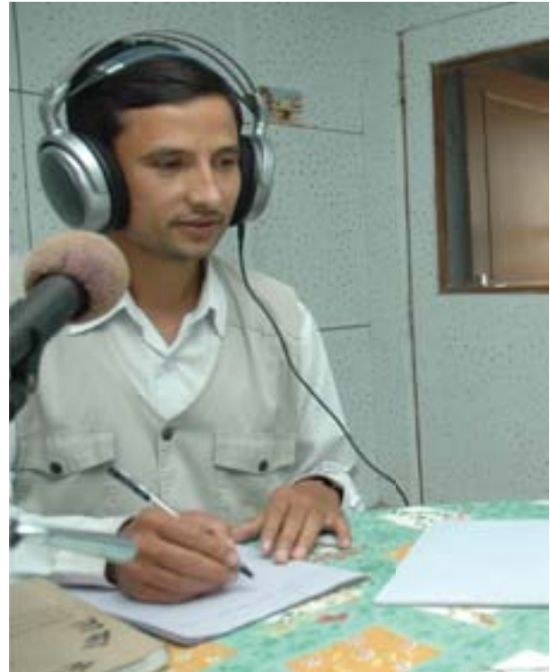
Science lessons are broadcast via the Madan Pokhara Community Radio station

The UCPD Nepal is structured as follows: