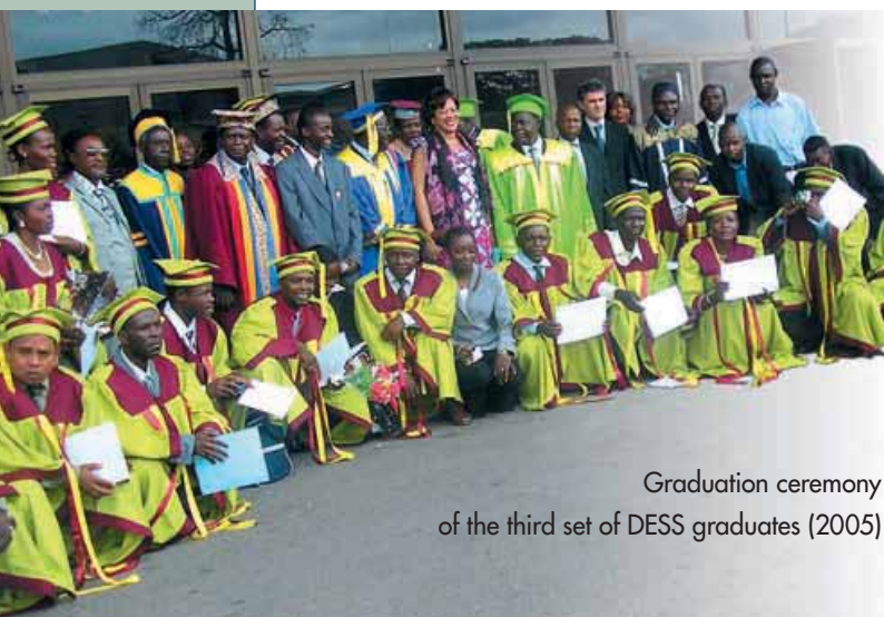
Graduation ceremony of the third set of DESS graduates (2005)