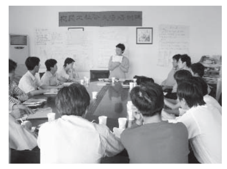
Training for migrants in Chengdu, 2004