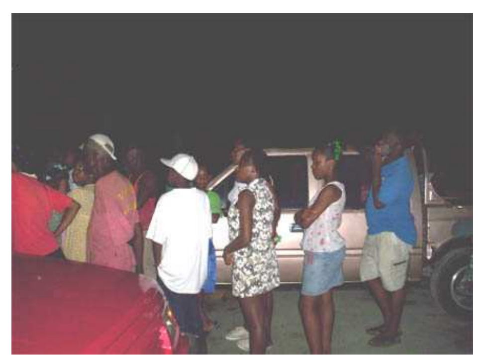
Audience at PowerPoint presentation