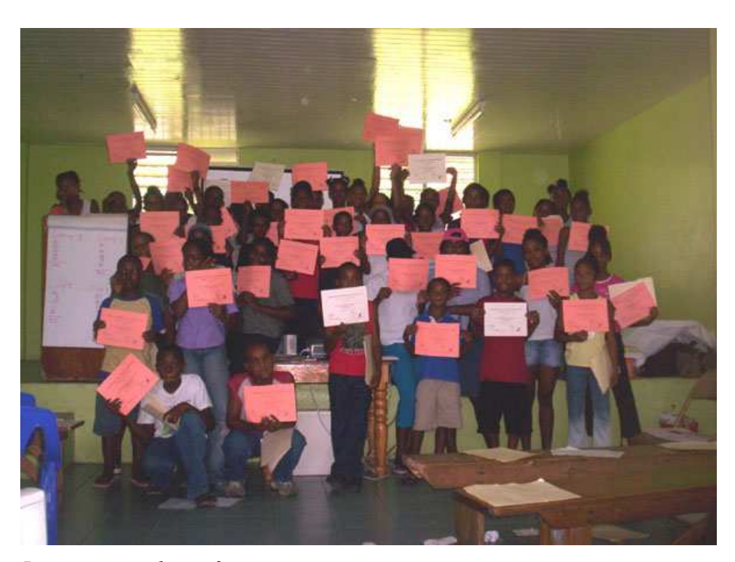
Participants with certificates