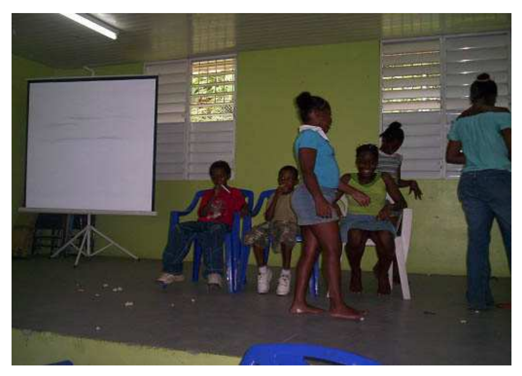
Drama presentation on littering on the "block"