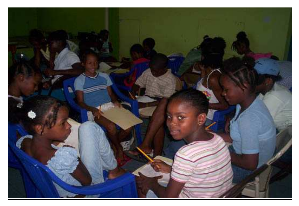
Group work during Day 1 of workshop