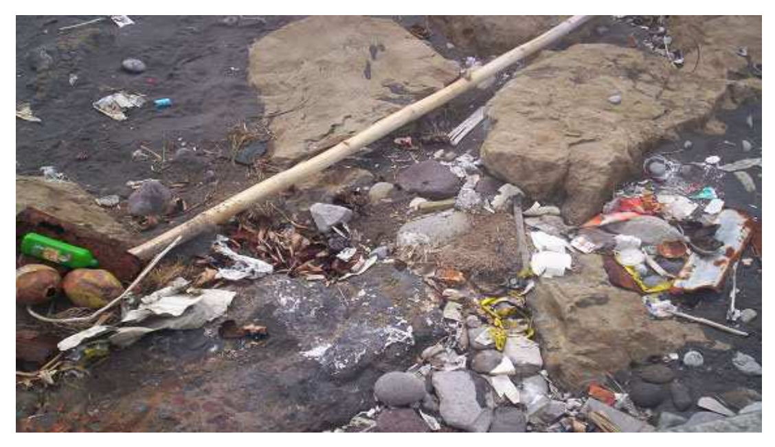
Exit point of ravine on sea shore