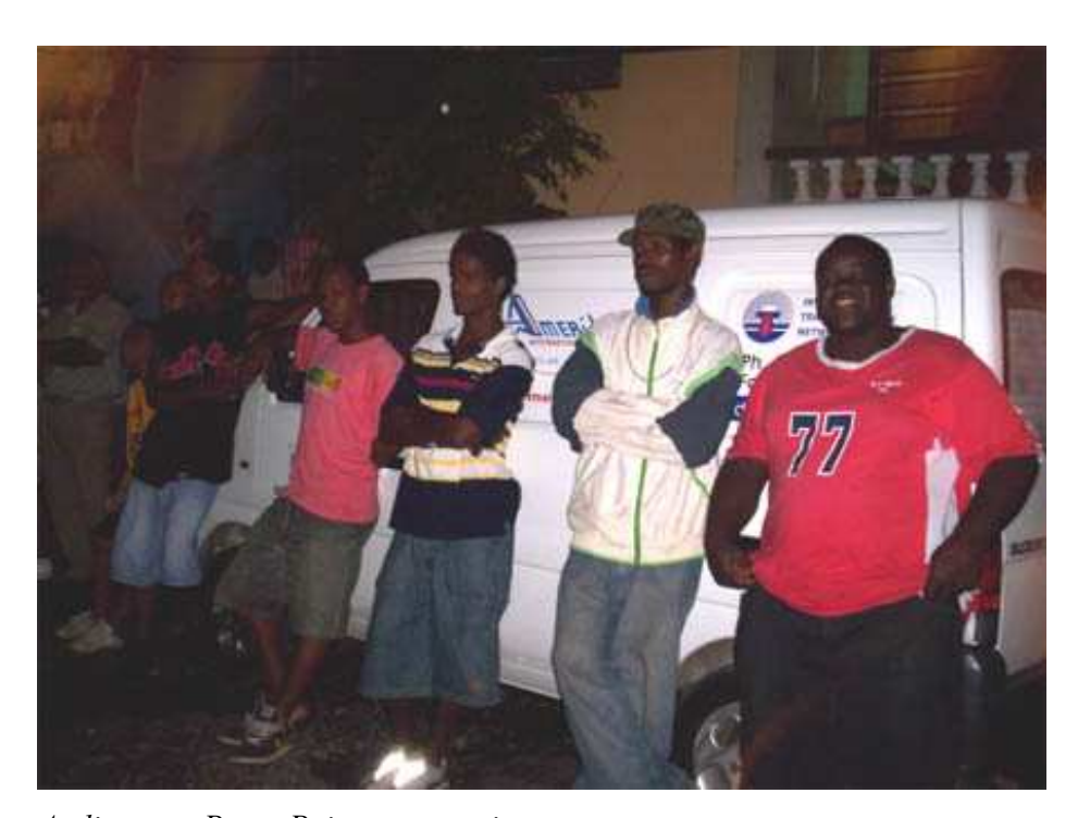
Audience at PowerPoint presentation