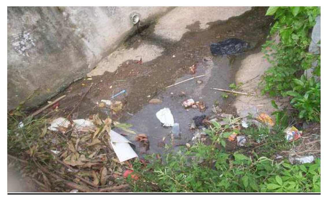
Section of ravine before cleanup