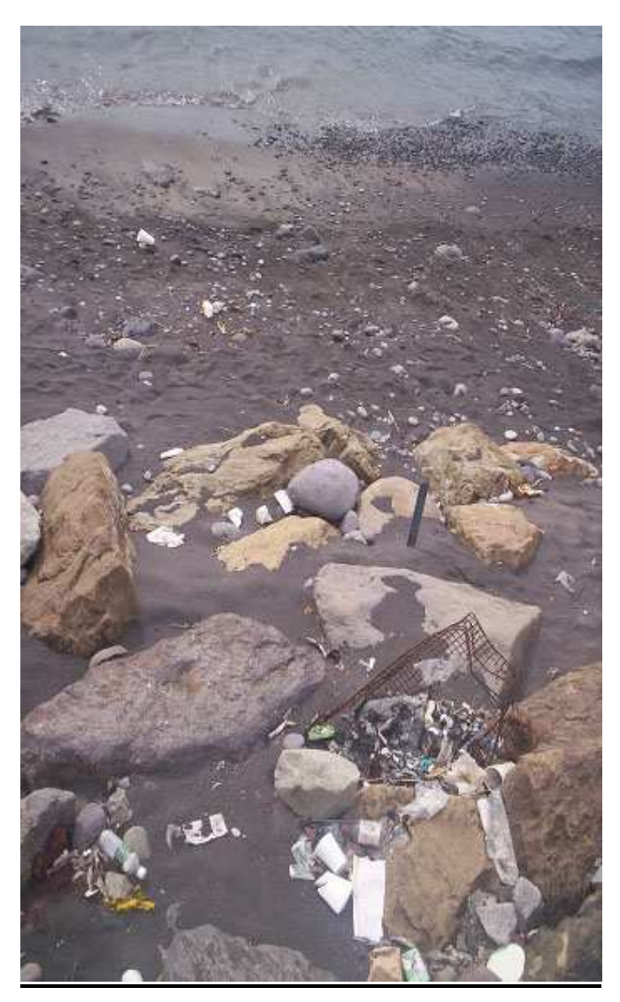
Rubbish on sea shore