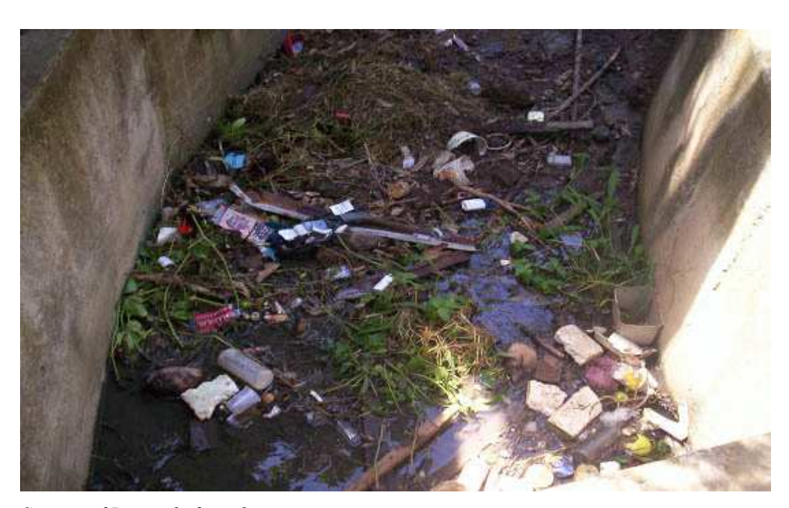
Section of Ravine before cleanup