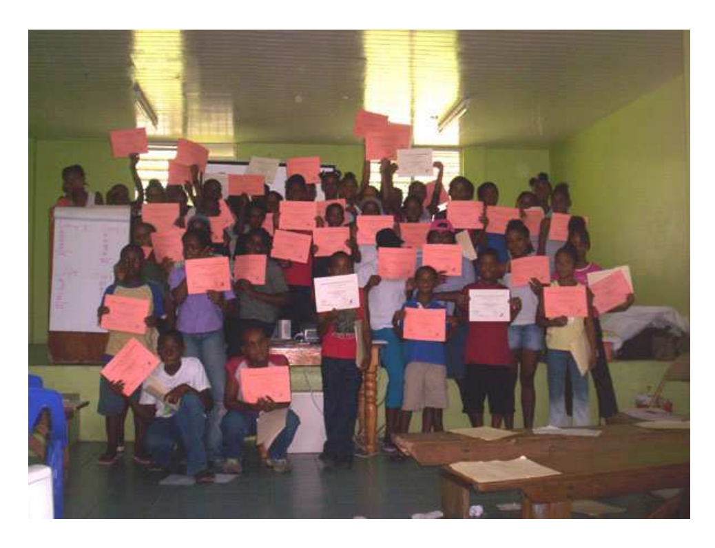
July - December 2005