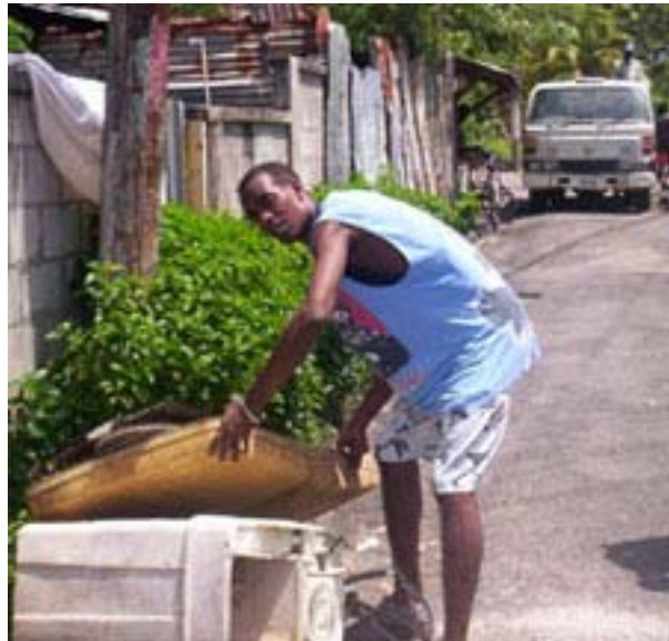
Heavy Garbage Day, Dominica