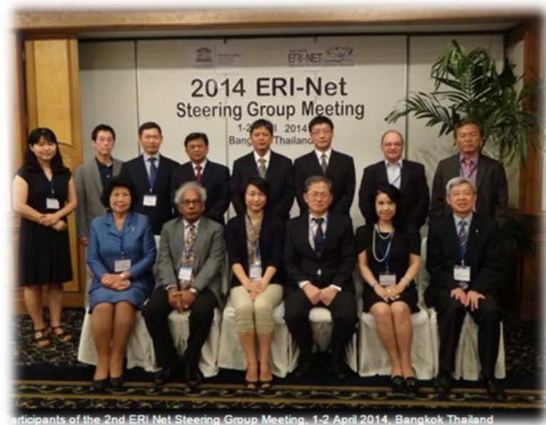
Participants of the 2nd ERI-Net Steering Group Meeting, 1-2 April 2014, Bangkok Thailand