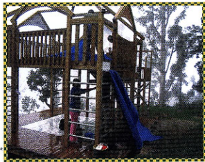
Volunteers working hard in the rain to complete artistic interpretation on KDZ