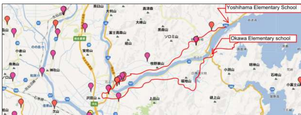
Chart3: The Ishinomaki City