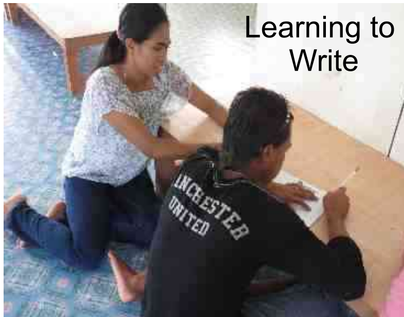
Learning to Write