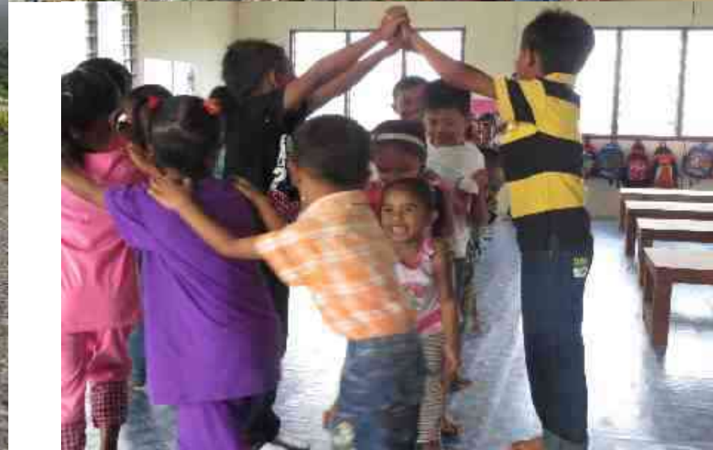
CSR Program at Arus Sawit Estate, Borneo