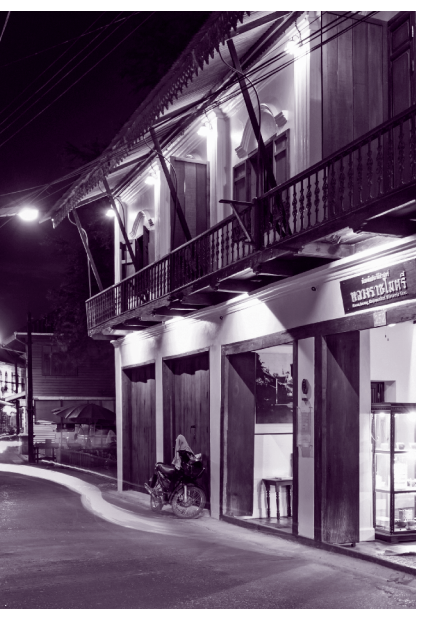
2015 Award of Merit : Baan Luang Rajamaitri, Chantaburi, Thailand

Wanslea Cancer Wellness Centre, Cottesloe, Western Australia The restoration of the historic Wanslea property to house various cancer support and assistance groups is notable for its sensitive approach to embracing and articulating the multilayered history of the site.