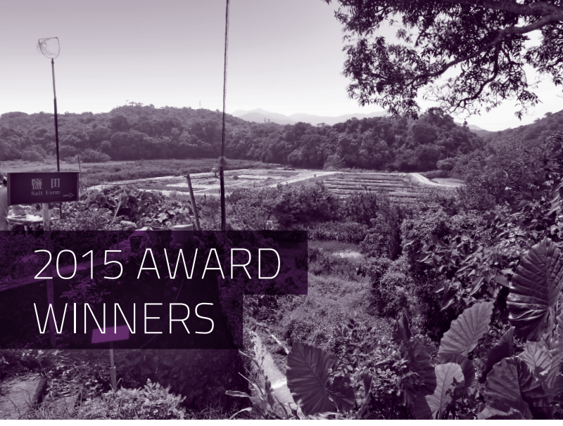
2015 Award of Distinction : Saltpans of Yim Tin Tsai, Hong Kong SAR, China