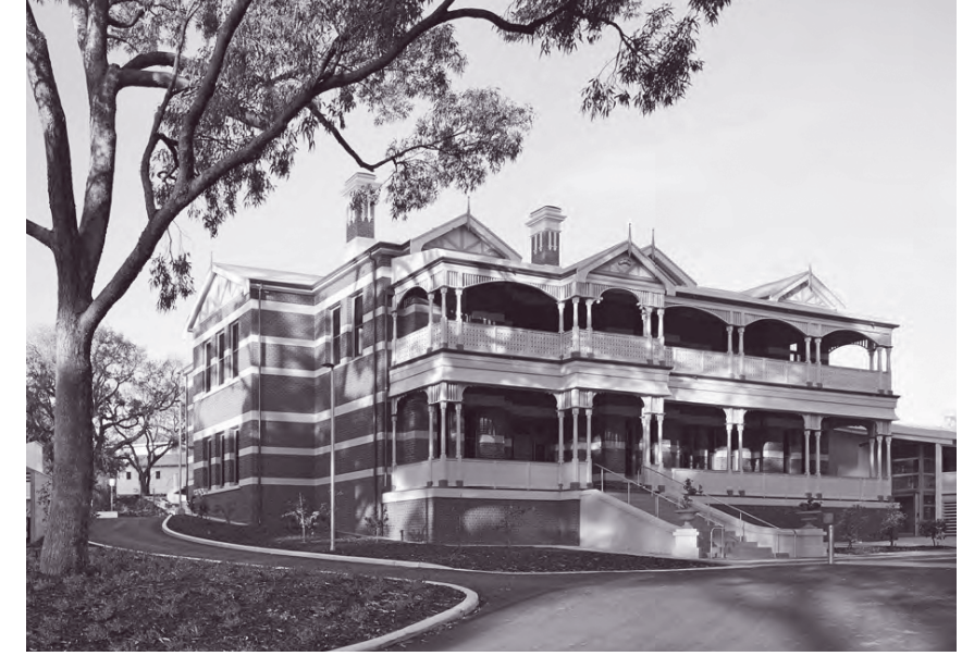
2015 Honourable Mention : Wanslea Cancer Wellness Centre, Cottesloe, Western Australia 2015 Award of Distinction : J.N. Petit Institute, Mumbai, India