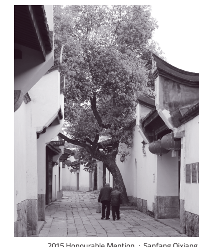
2015 Honourable Mention : Sanfang Qixiang, Fuzhou, Fujian Province, China

The United Nations Educational, Scientific and Cultural Organization (UNESCO) is at the vanguard of international efforts to safeguard cultural heritage.