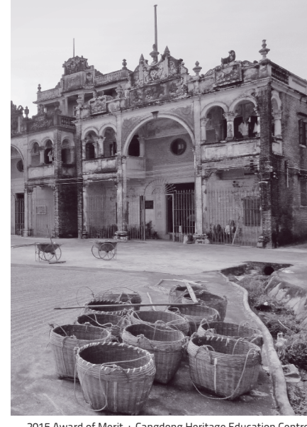
2015 Honourable Mention:YHA Mei Ho House Youth Hostel, Hong Kong SAR, China 2015 Award of Merit : Cangdong Heritage Education Centre, Guangdong Province, China