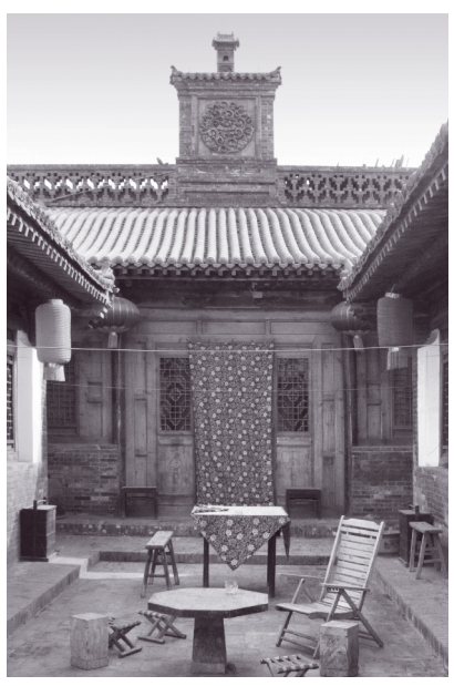
2015 Award of Merit : Ping Yao Courtyard Houses, Shanxi Province, China

UNESCO is the only United Nations agency with a mandate in cultural heritage.