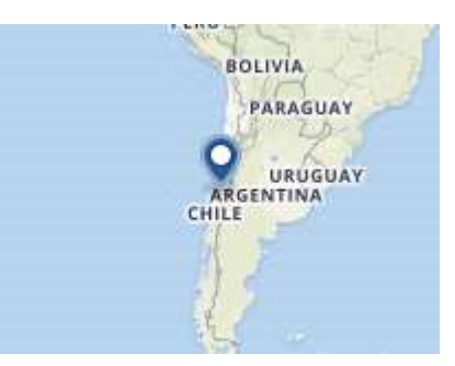
Data © OpenStreetMap Design © Mapbox

17,948,000 (2015) 2,737,000 (2015) 34.4 (2015) 1.07%