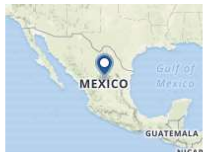
Data © OpenStreetMap Design © Mapbox

127,017,000 (2015) 23,276,000 (2015) 27.4 (2015) 1.37%