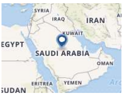
Data © OpenStreetMap Design © Mapbox

31,540,000 (2015) 4,929,000 (2015) 28.3 (2015) 2.32%