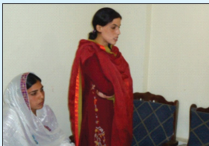
Supervisor and Teachers