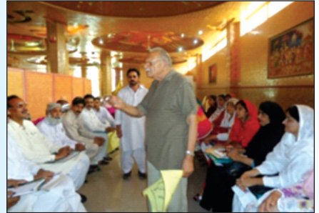
Gender Sensitization Workshops