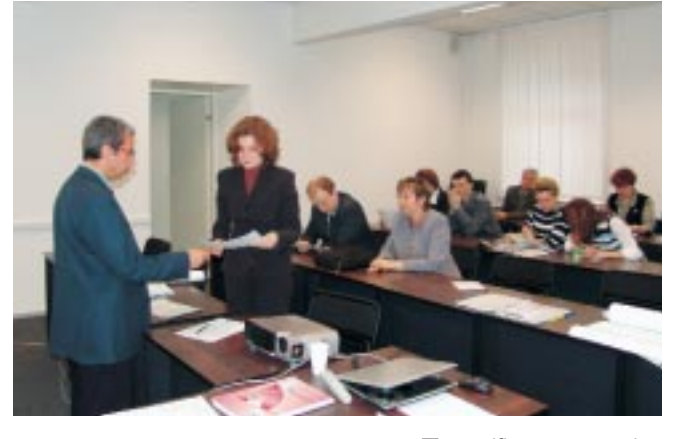
The certificates presentation