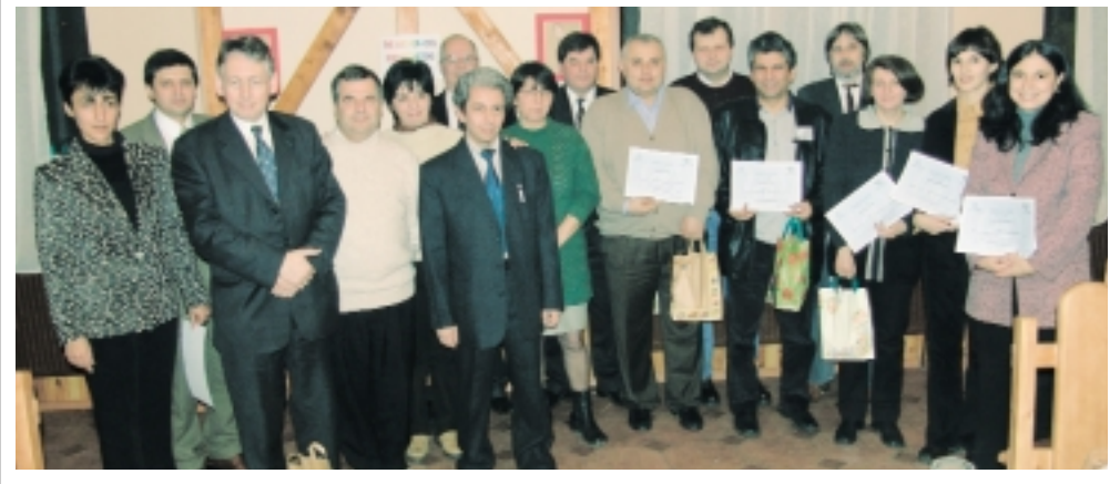
The training seminar. The presentation of certificates

projects with partners from the neighbouring countries.