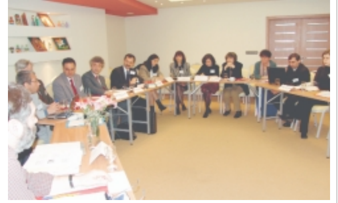
Workshop ICTs in History Education