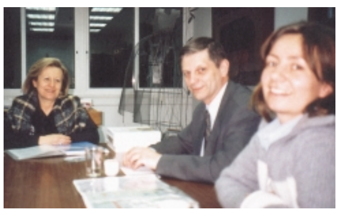
Meeting with Eleni Nikita, General Secretary of Cyprus National Commission for UNESCO

The Cyprus Seminar on the Use of Information Technology across School Curriculum, organized jointly by the UNESCO Section for General Secondary Education and IITE (Moscow) in close cooperation with the Cyprus National Commission UNESCO, Cyprus Ministry of Education and Culture and Cyprus Pedagogical Institute, was held in Nicosia, Cyprus, from 7 to 11 January 2002 at the Cyprus Pedagogical Institute, where a team of three consultants (Bent B.