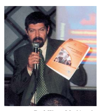
Prof. Wayne Mackintosh, University of Auckland (New Zealand)

There is a widely spread belief in South African HEIs that they fall behind the developed world in the application of ICTs. For the public higher education system operating with extremely limited resources, this is especially serious. Even the best HEI systems are not as sophisticated as those of the developed nations, and there are many institutions, which systems and levels of connectivity can be considered negligible. The absence of appropriate technological support and infrastructure necessary to secure high levels of connectivity is likely