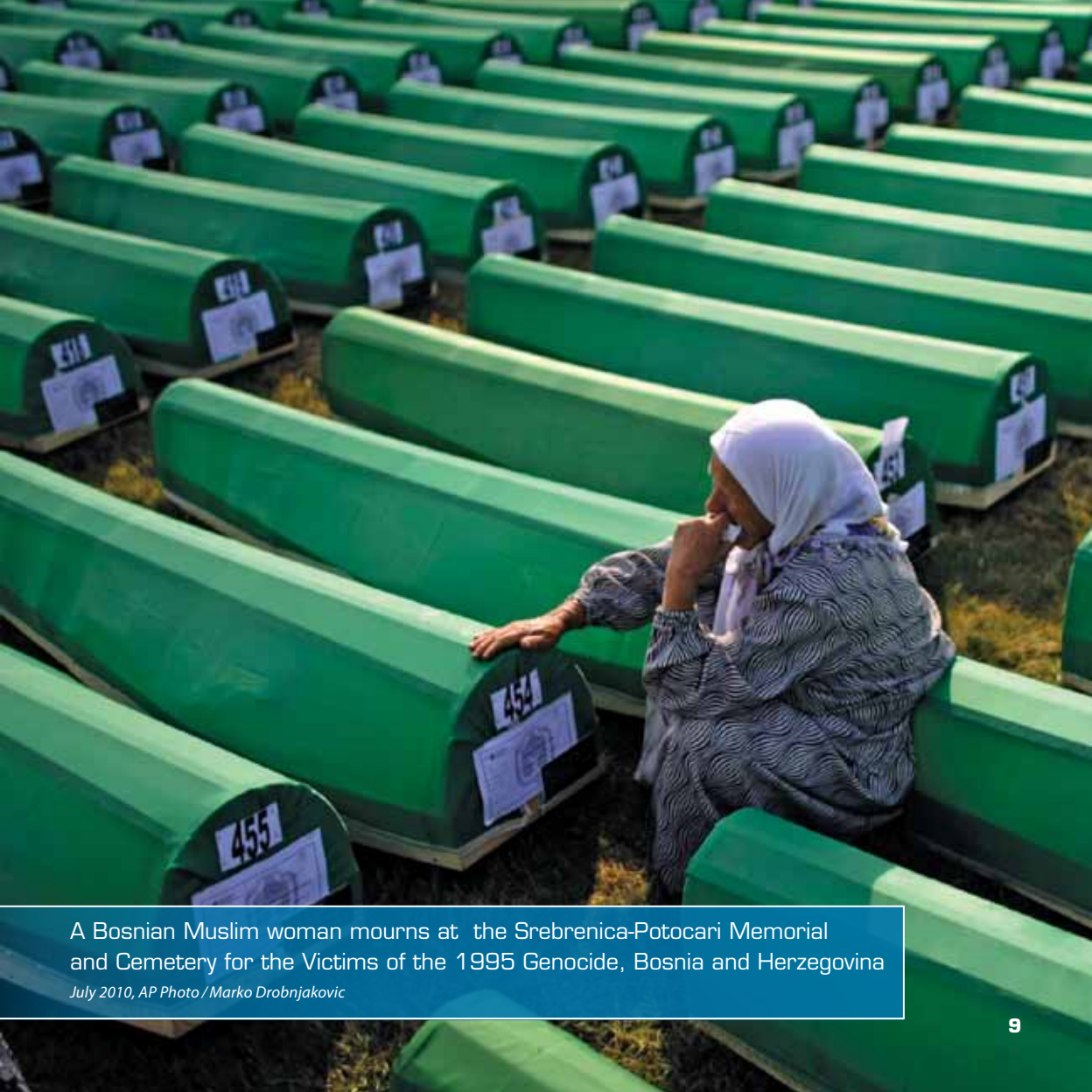
A Bosnian Muslim woman mourns at the Srebrenica-Potocari Memorial and Cemetery for the Victims of the 1995 Genocide, Bosnia and Herzegovina July 2010