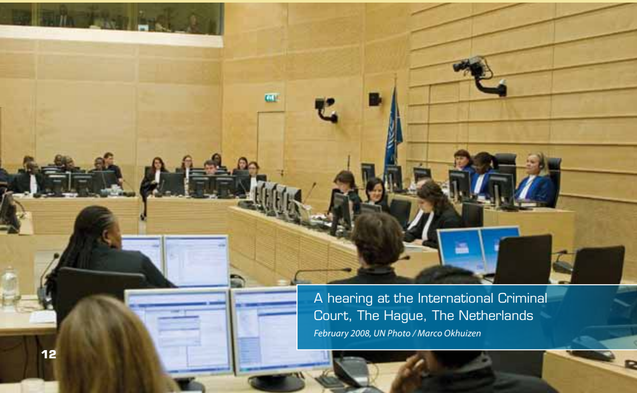
A hearing at the International Criminal Court, The Hague, The Netherlands

Where genocide does occur, the International Criminal Court (ICC), which is separate from and independent of the United Nations, is empowered to investigate and prosecute those most responsible, if a State is unwilling or unable to exercise jurisdiction over alleged perpetrators. Fighting impunity and establishing a credible expectation that the perpetrators of genocide and related crimes will be held accountable can contribute effectively to a culture of prevention.