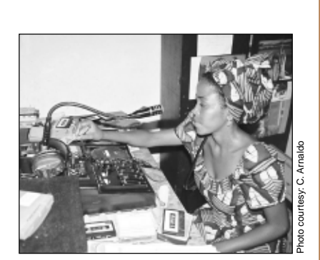
Woman technician doing maintenance of Suitcase Radio in the Niger

The Suitcase Radio, a complete broadcast station in a single case and complete with a high gain antenna, is a product of Wantok Enterprises in Canada. The station is fully portable or may be used as a permanent FM community broadcast station. The console portion of the system is ideal for community access to existing networks and is often used by CMCs because of its low-cost, easyto-use and robust advantage. This radio comes in 30 watt, 50 watt and 100 watt versions. For more information see http://www.wantokent.com