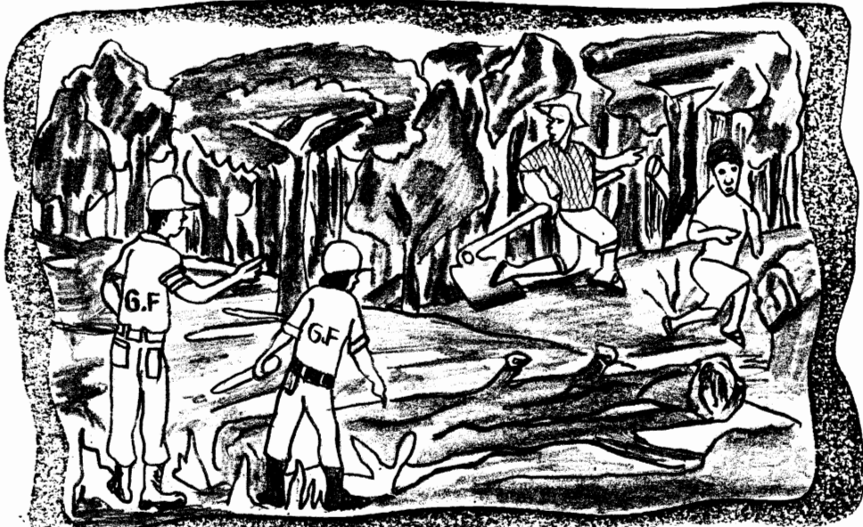
URGENT MEASURES HAD TO BE TAKEN TO FIGHT AGAINST ALL KINDS OF DESTROYERS