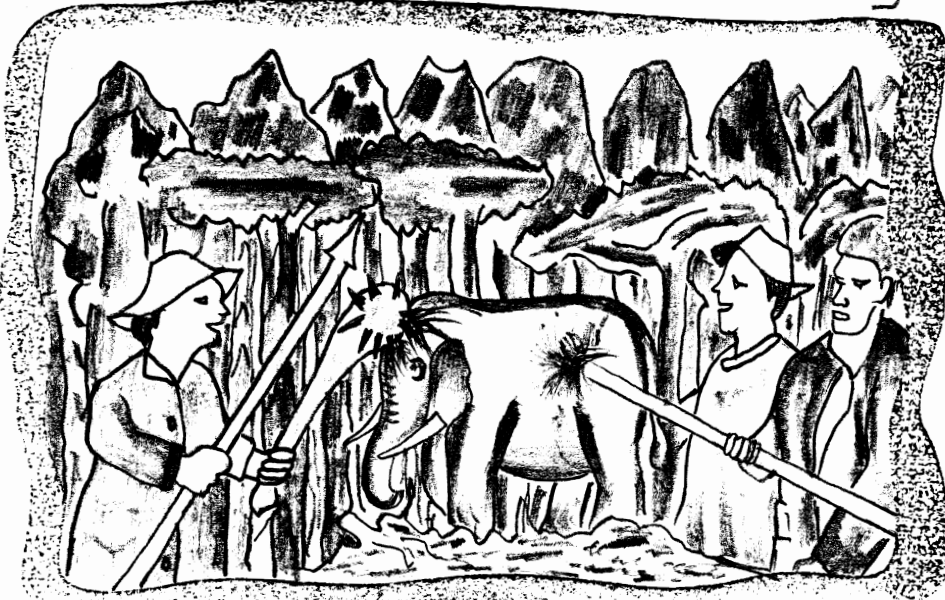
HUNTERS USED TO KILL ELEPHANTS IN ORDER TO SELL TUSKS