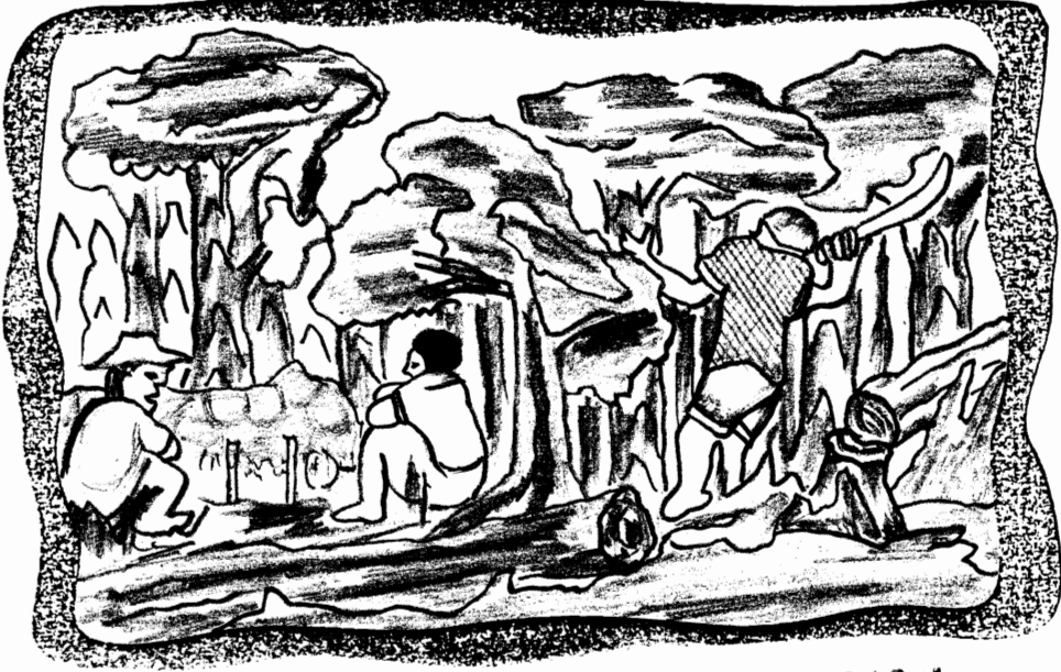
OTHERS COULD CUT TREES IN THE PARK IN ORDER TO PRODUCE FROM THEM CHARCOAL