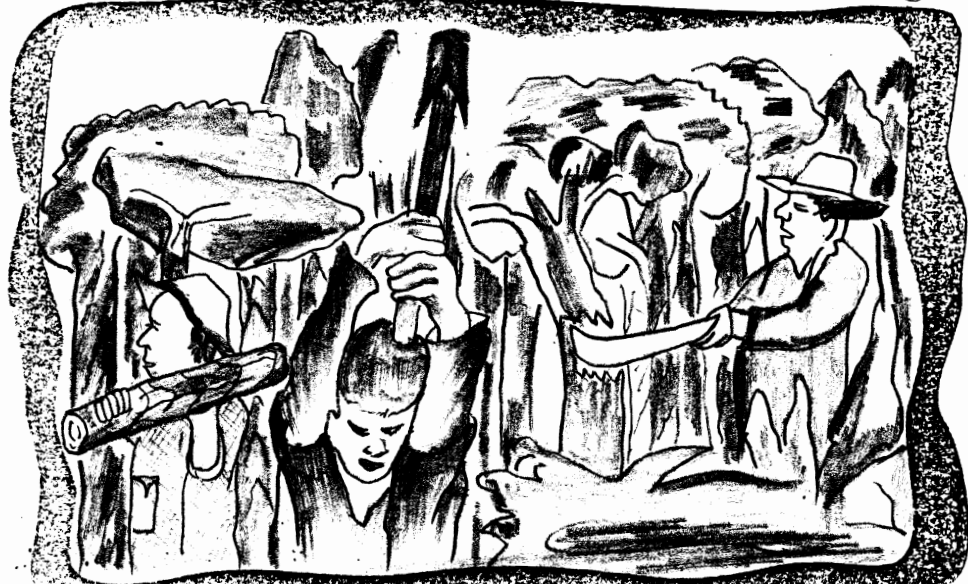
NATIVES DESTROYED THE FOREST THAT PRODUCES RAIN AND FRESH AIR