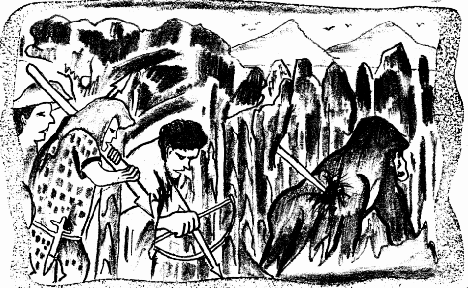
HUNTERS USED TO KILL GORILLAS WITH THEIR SPEARS