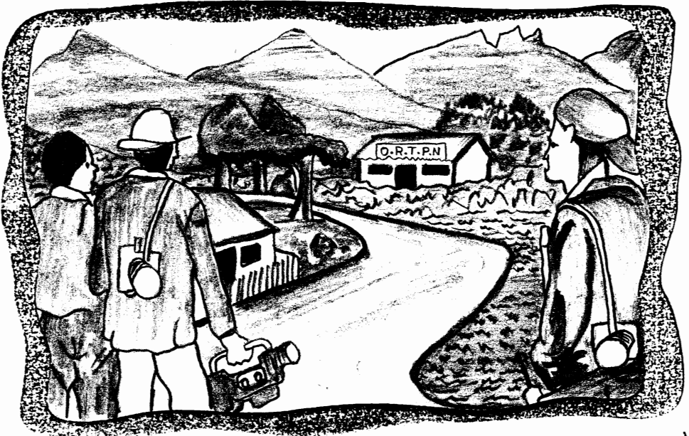
TOURISTS FREELY CHOOSE NICE HOTELS IN WHICH THEY ENJOY THEIR STAY AFTER VISITING GORILLAS 16