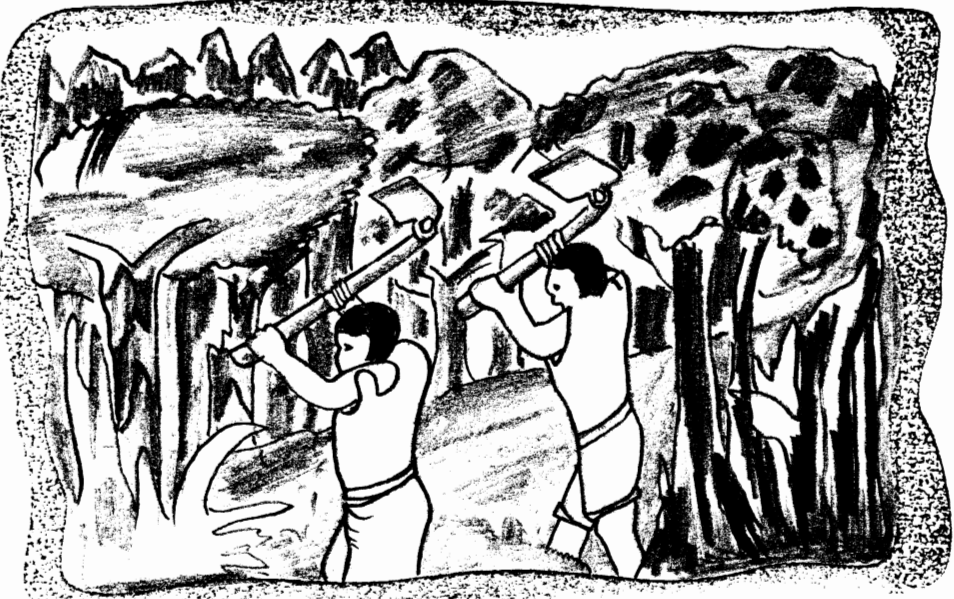
SOME PEOPLE WHO LIVE NEAR THE PARK USED TO DESTROY IT BY GROWING THEIR OWN PLANTS