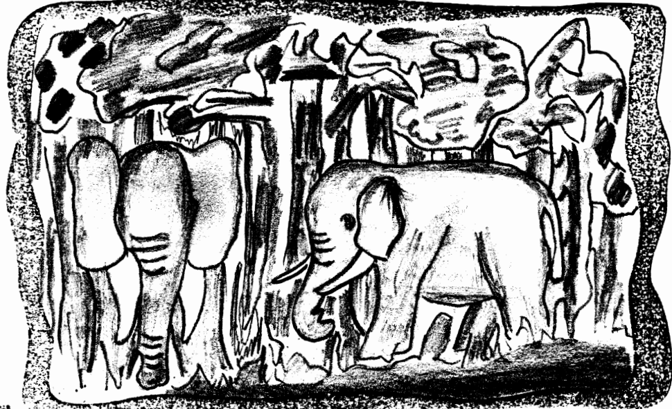
YOU ARE ALL INVITED TO COME AND SEE ELEPHANTS AND GORILLAS MOUNTAIN.