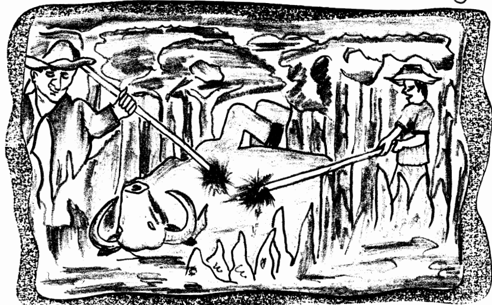
OTHERS USED TO KILL BUFFALOES IN ORDER TO GET MEAT