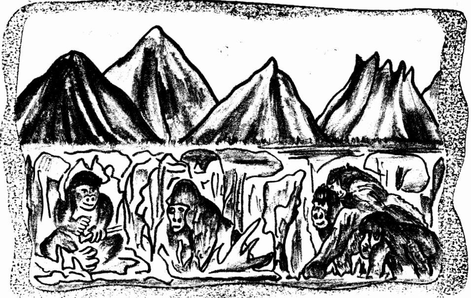
YOU CAN SEE WHERE GORILLAS LIVE AND WHAT THEY DO