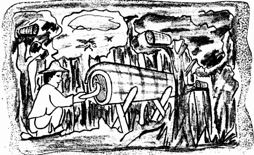
THE NATIONAL PARK OF VOLCANOES HAS ALSO BEEN DESTROYED BY BEE KEEPERS