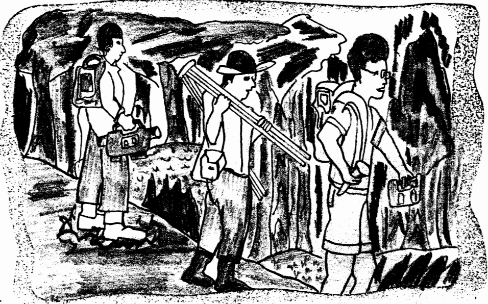
TOURISTS CAN GO WHEREVER THEY WANT IN THE COUNTRY