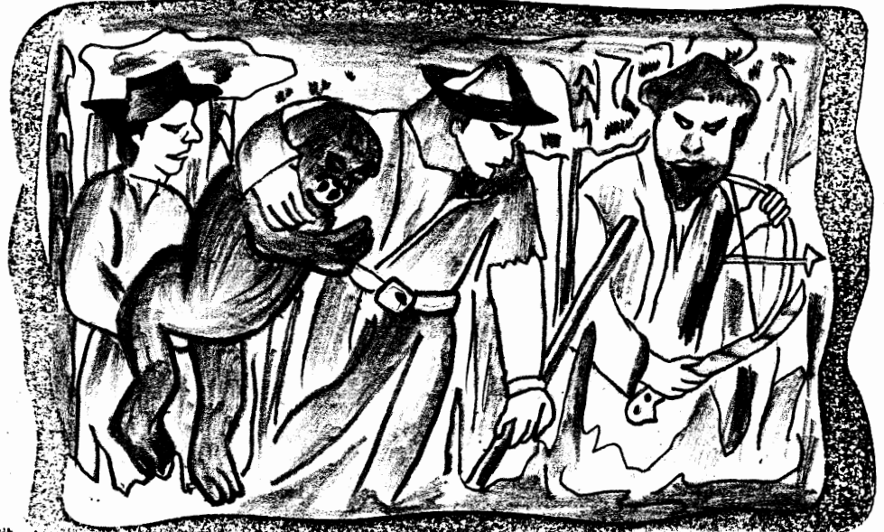
THEIVES USED TO STEAL GORILLAS BABIES