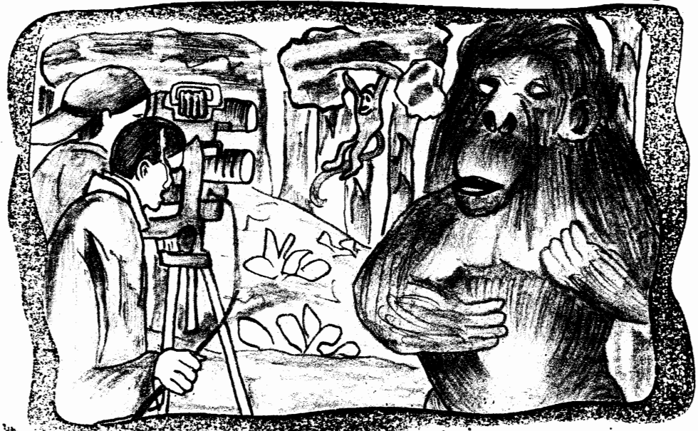
TOURISTS CAN TAKE PHOTOS OF ALL ANIMALS THEY SEE IN THE PARK