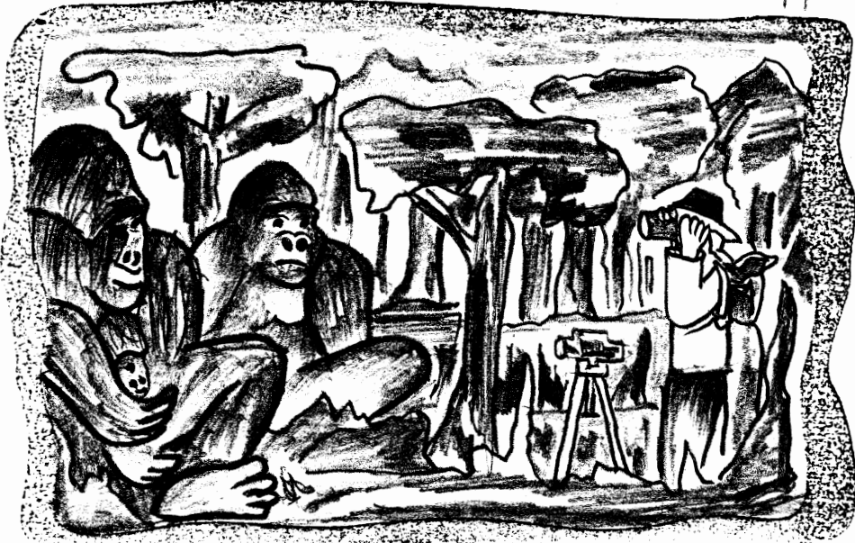
EVERY ONE CAN SEE HOW GORILLAS LOVE EACH OTHER