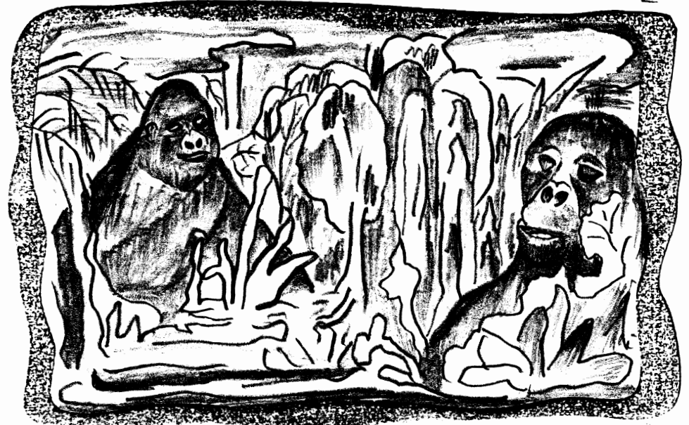
GORILLAS LIVE IN RWANDAN NATIONAL PARK OF VOLCANOES