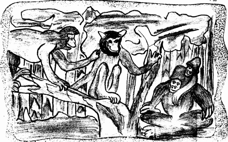
IN THE PARK YOU CAN SEE MONKEYS PLAYING IN THE BRANCHES OF TREES.