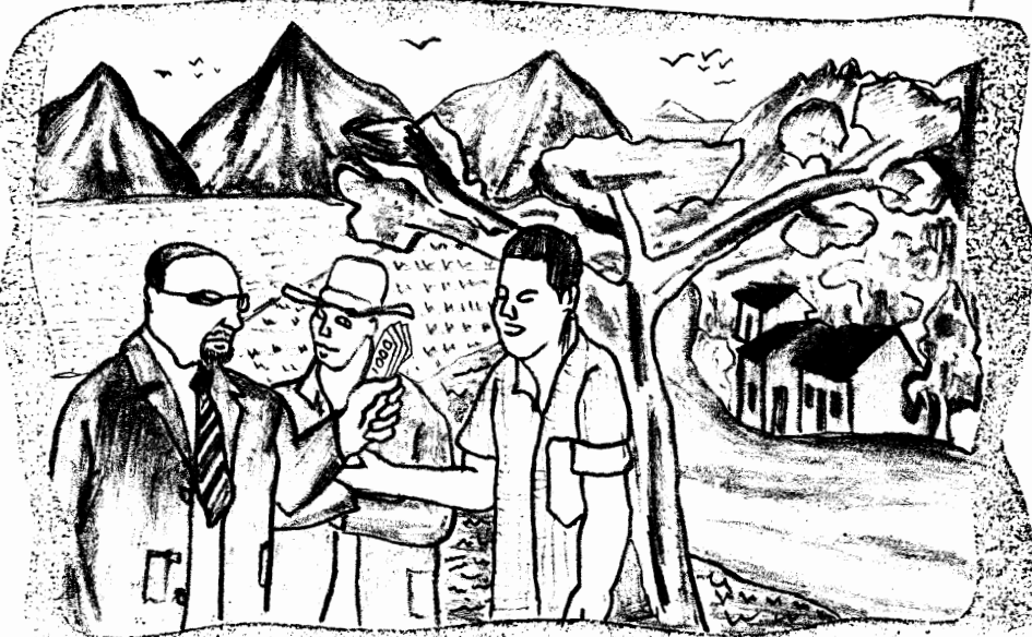
FOREIGNERS USE TO GIVE MONEY TO NATIVES SO THAT THEY MIGHT STEAL THEY COUNTRY'S RICHNESS