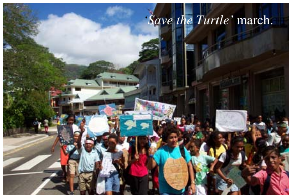
'Save the Turtle' march.

their adventure to this World Heritage Site. You will also be informed about this year's SUBIOS competitions which have already been launched. A brief report on the SMB