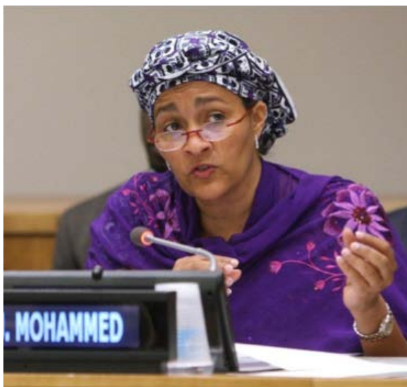
Amina J. Mohammed, United Nations Secretary-General Ban Ki-moon's Special Adviser on Post-2015 Development Planning