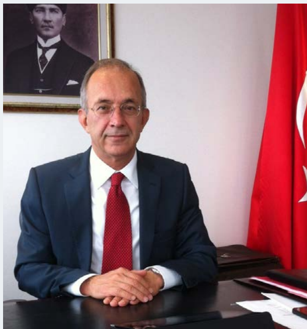
Permanent Representative of Turkey to the United Nations