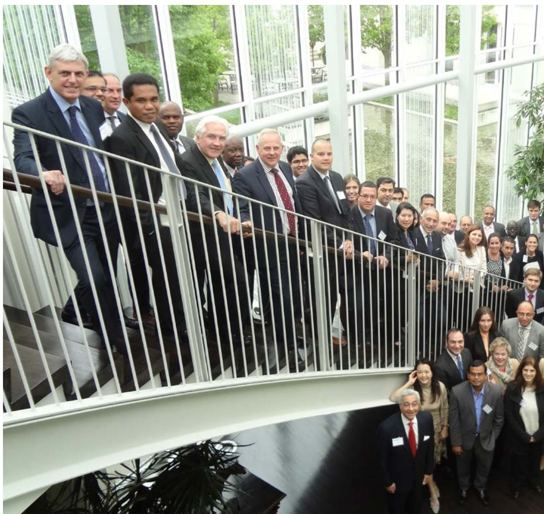
Participants of the Global Experts Meeting at Greentree on 13 - 14 May 2014

The Meeting helped identify and prioritize the needs of Member States in the areas of designations and the freezing of terrorists' assets, such as weaknesses in national coordination, spotty regulatory measures, ineffective liaison with the private sector and