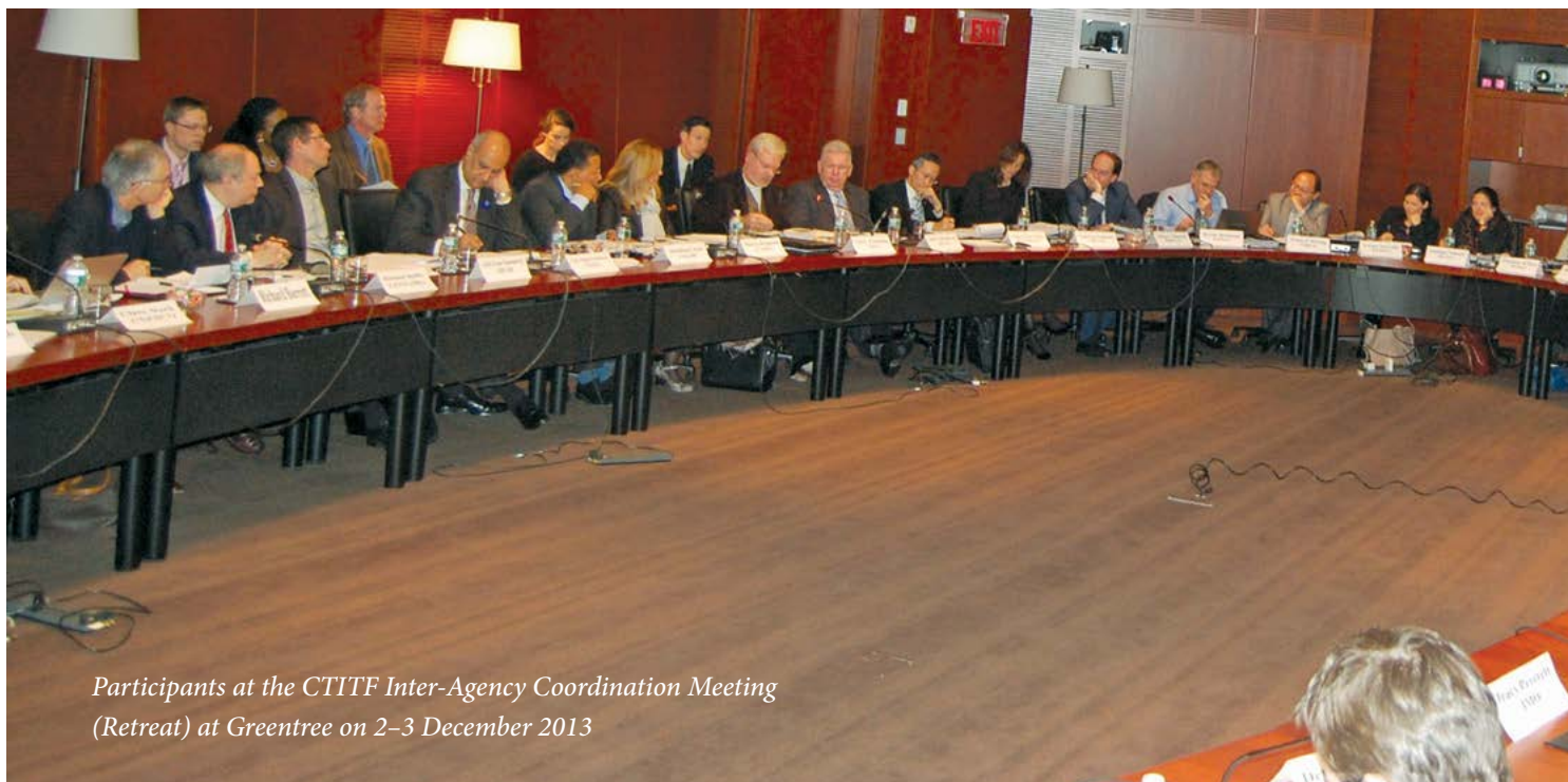
Participants at the CTITF Inter-Agency Coordination Meeting (Retreat) at Greentree on 2–3 December 2013

Participants discussed ways to engage with Special Political Missions and Peacekeeping Operations on the ground in order to integrate the UN's conflict prevention mandate more