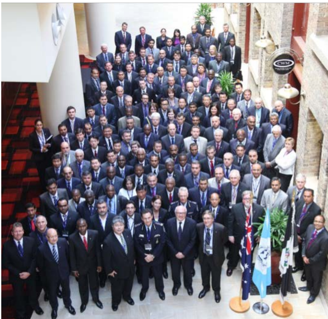
Participants at the INTERPOL Global Security and Counter-Terrorism Convention in Sydney, Australia, 28-30 January 2014

The event was also designed to identify good global security and counter-terrorism practices and initiatives. In particular it focused on contemporary trends in transnational crime, which are highly relevant to the global law enforcement community. In addition, it aimed to foster awareness and understanding of the tools and resources that INTERPOL has at its disposal to combat such global threats, including the expertise of individual Member States on key issues. ■