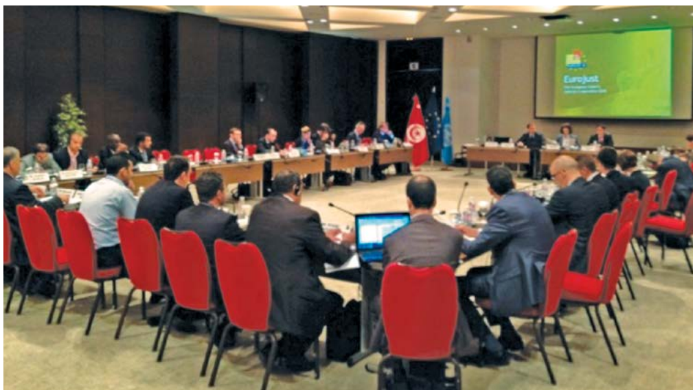
Participants at the regional workshop held in Tunisia, from 2 to 3 June 2014

This workshop was an ideal opportunity to set strategic priorities for further implementation of the project and to encourage strong mobilisation of all relevant stakeholders at the national