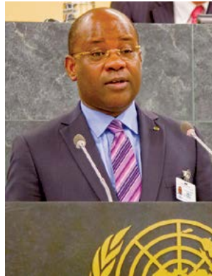
Jérôme Bougouma, Minister of Territorial Administration and Security of Burkina Faso, during the General Assembly Fourth Biennial Review of the United Nations Global Counter-Terrorism Strategy on 12 June 2014.

Kleib, Deputy Foreign Minister of the Republic of Indonesia; H.E. Mr. Gonzalo de Benito, Deputy Minister for Foreign Affairs of Spain; H.E. Mr. Pereira Ame Silima, Deputy Minister of Home Affairs of the United Republic of Tanzania; H.E. Ambassador Erdoğan İçsan, Under-Secretary of the Ministry of Foreign Affairs of Turkey, who spoke on behalf of H.E. Mr. Ahmet Davutoğlu, Minister for Foreign Affairs of Turkey; H.E. Mr. Stephan Husy, Coordinator for International Counter-Terrorism, Federal Department of Foreign Affairs of Switzerland; H.E. Nassir Abdulazziz Al-Nasser, United Nations High Representative for the Alliance of Civilizations; and Under-Secretary-General for Political Affairs, Chair of the CTITF and Executive Director of UNCCT Mr. Jeffrey Feltman. ■