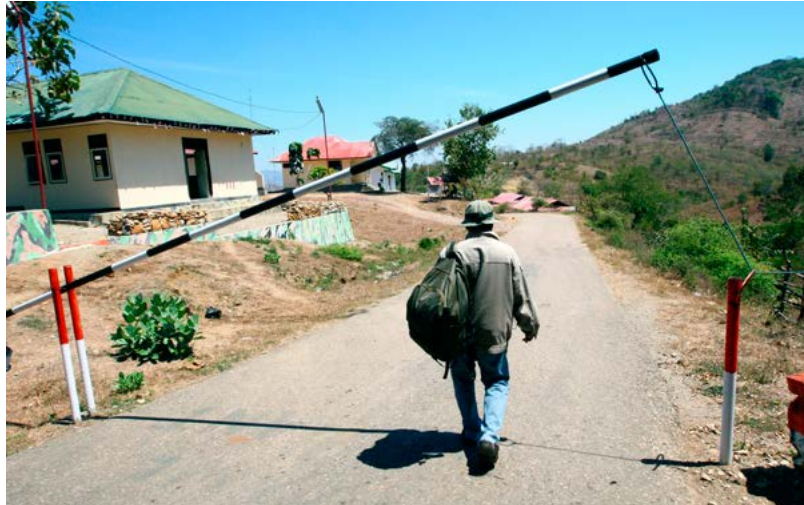
Border crossing

Participants from the 11 States of the Sahel and the Maghreb engaged in lively