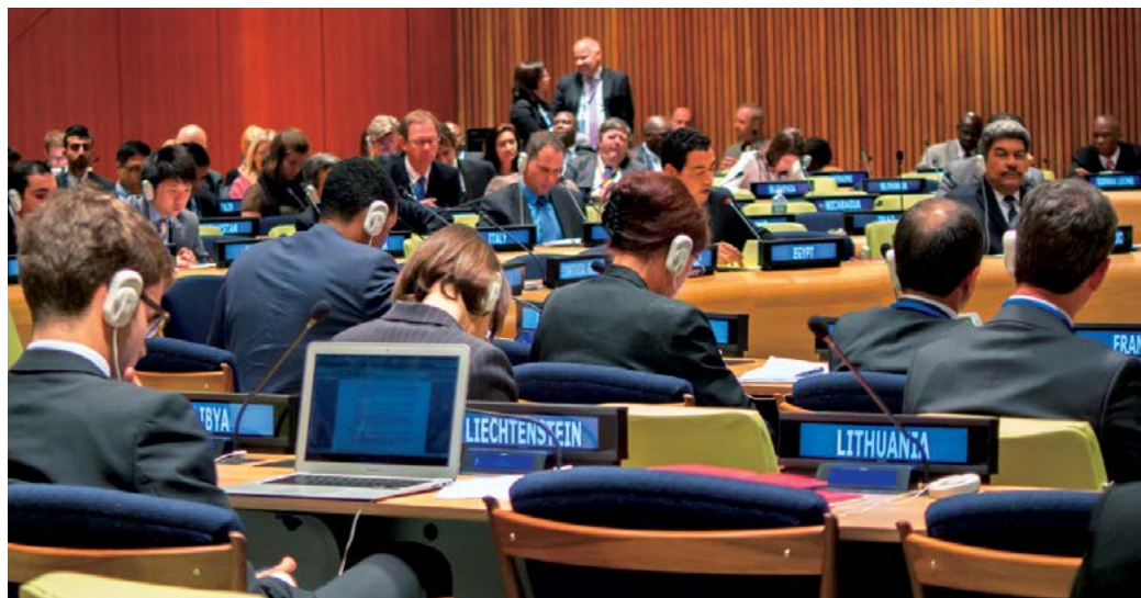
Member States during the "President of the General Assembly's Interactive Dialogue on Addressing Conditions Conducive to Terrorism" on 11 June 2014.

terrorism strategy throughout the work of the UN, particularly in the context of conflict prevention, development and human rights and to further efforts to strengthen coordination and coherence of UN assistance to Member States. He also noted the three-pronged approach