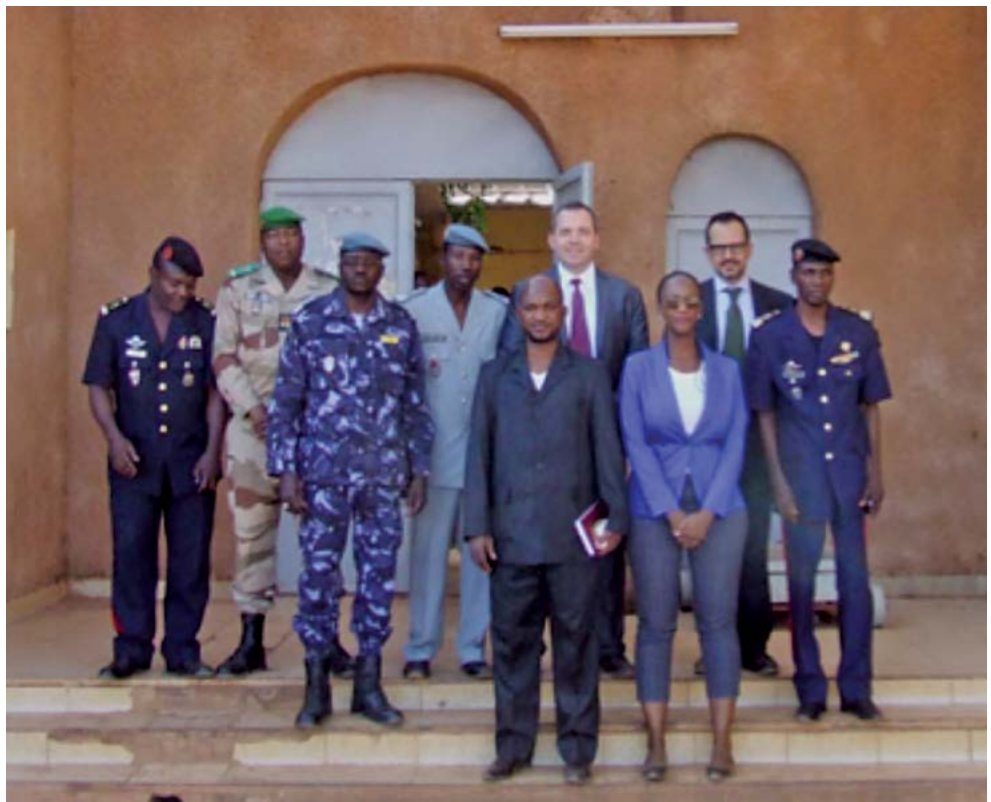
The Group of Experts supporting the 1540 Committee actively participates in the activities of the Counter-Terrorism Implementation Task Force (CTITF) as one of the CTITF entities

Through a cooperative spirit, the 1540 Committee endeavoured to assist States in implementing the obligations contained in the resolution. In this context, the 1540 Committee is holding various events in 2014 dedicated to commemorate the tenth anniversary of the adoption of resolution 1540 (2004). ■