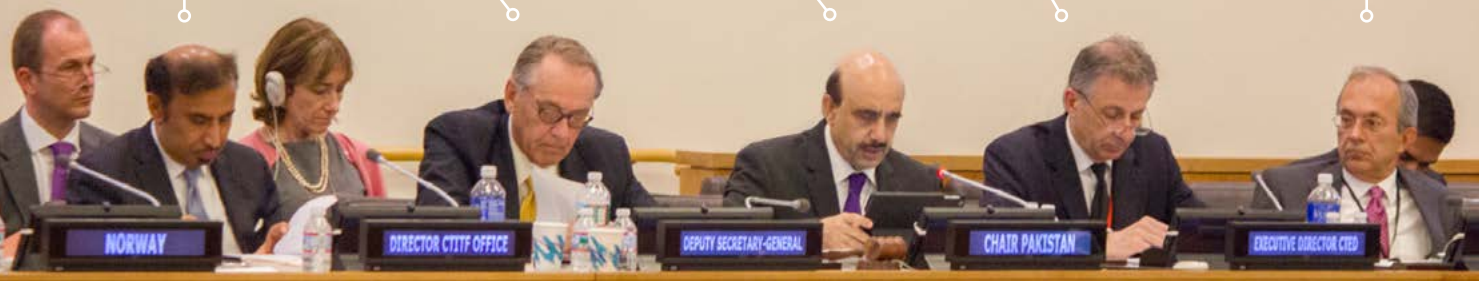
Ambassador Y. Halit Çevik, Permanent Representative of Turkey to the United Nations

of an effective criminal justice system poses major challenges for developing countries because such systems can be extremely costly, in terms of both human and financial resources.