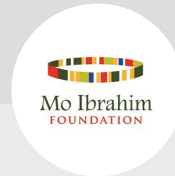
Mo Ibrahim Fdn @Mo_IbrahimFdn 99,411