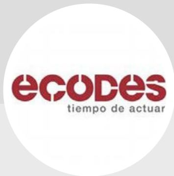
ECODES @ecodes 968,506