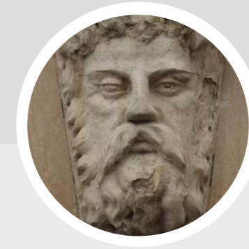
Joe Turner @bucksci 35