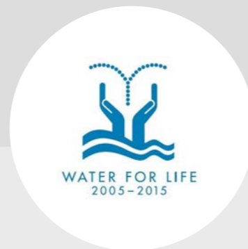
Water Decade @Water_Decade 132,636