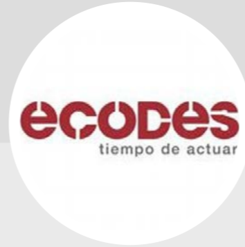
ECODES @ecodes 45