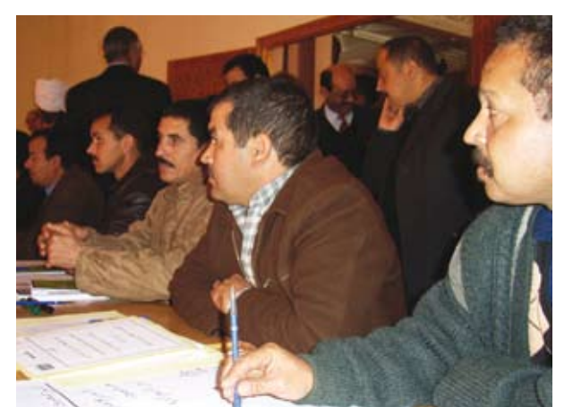
Visual impressions from the field visit: Community Centre for NGOs in Tahanaout, local cooperative of women in Amazmiz and literacy class in Marrakech.