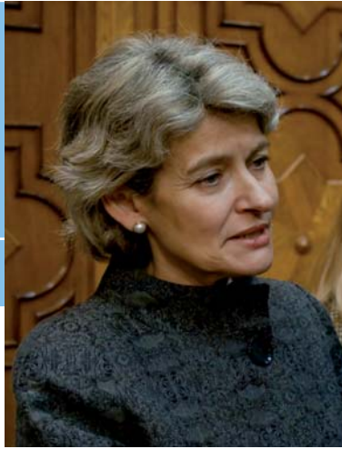
Irina Bokova, Director-General of UNESCO