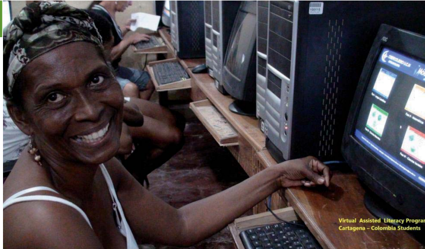
North Catholic University Foundation, 2010, ©

The North Catholic University Foundation in Antioquia, Colombia is awarded the 2010 Honourable Mention of the UNESCO King Sejong Literacy Prize for its Virtual Assisted Literacy Programme.