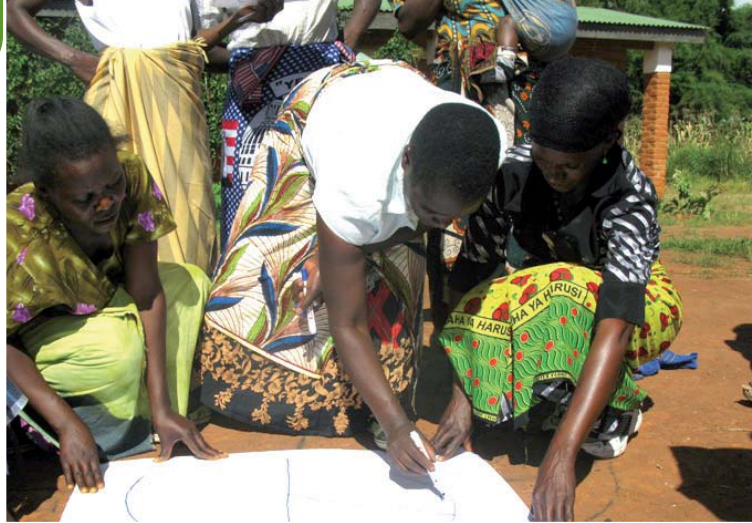
COWFA, 2010, ©

The Coalition of Women Farmers (COWFA) in Malawi is awarded the 2010 Honourable Mention of the UNESCO Confucius Prize for Literacy for its Women Land Rights Project (WOLAR).