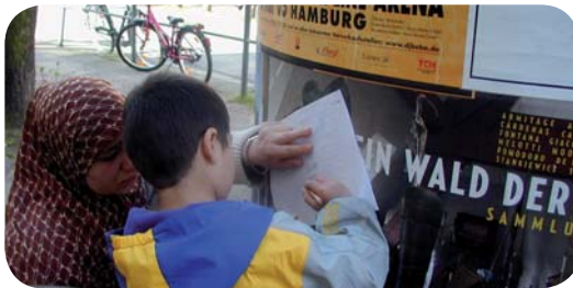
State Institute for Teacher Training and School Development, 2010, ©