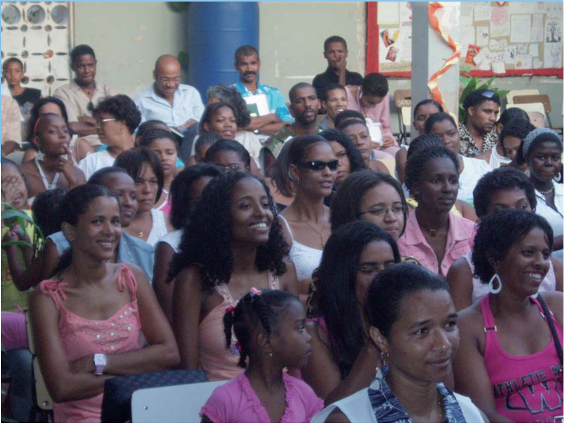
Direction Générale de l'Éducation et la Formation des Adultes (DGEFA), 2010. ©