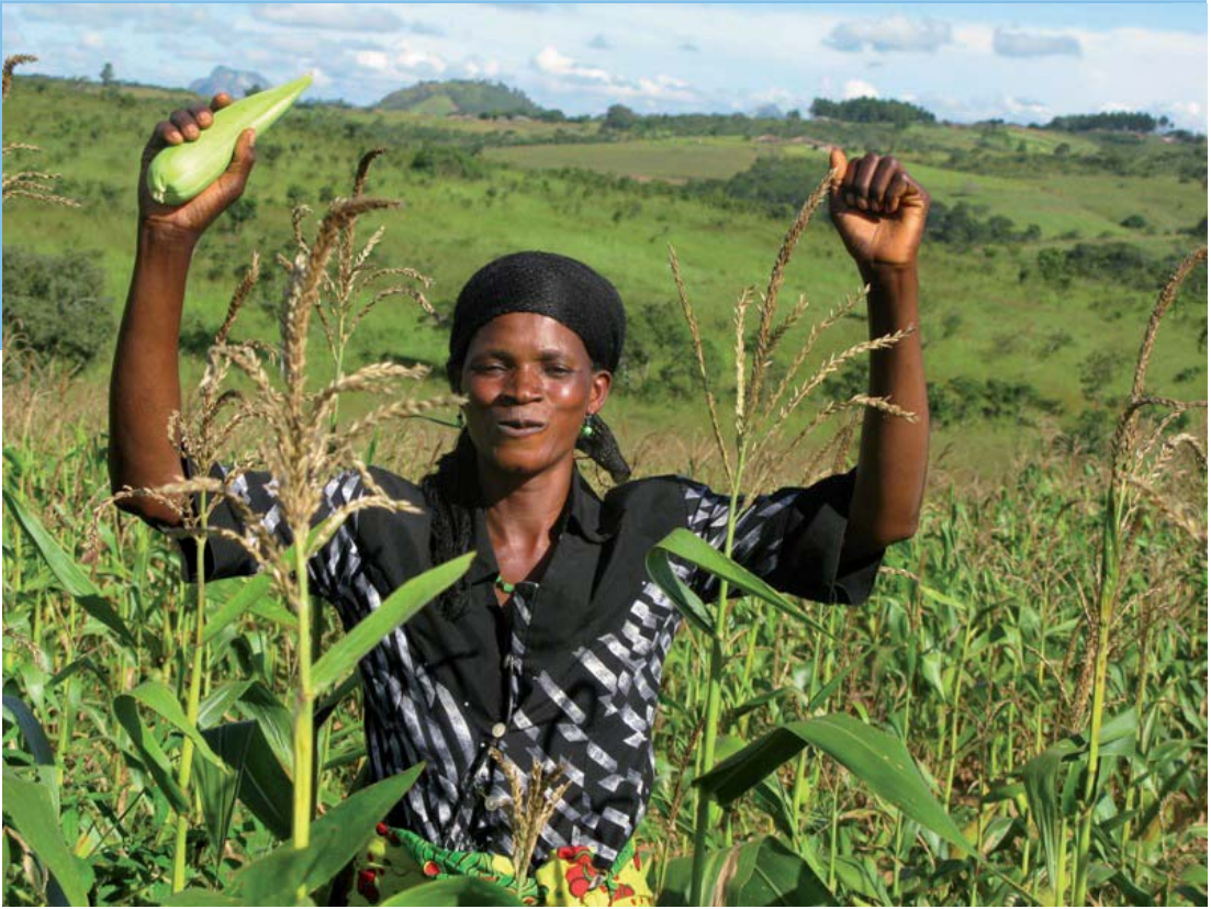
COWFA, 2010. ©