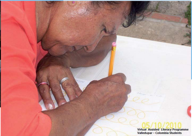
North Catholic University Foundation, 2010. ©