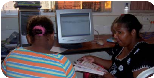
North Catholic University Foundation, 2010, ©