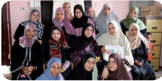
Governorate of Ismailia, 2010, ©