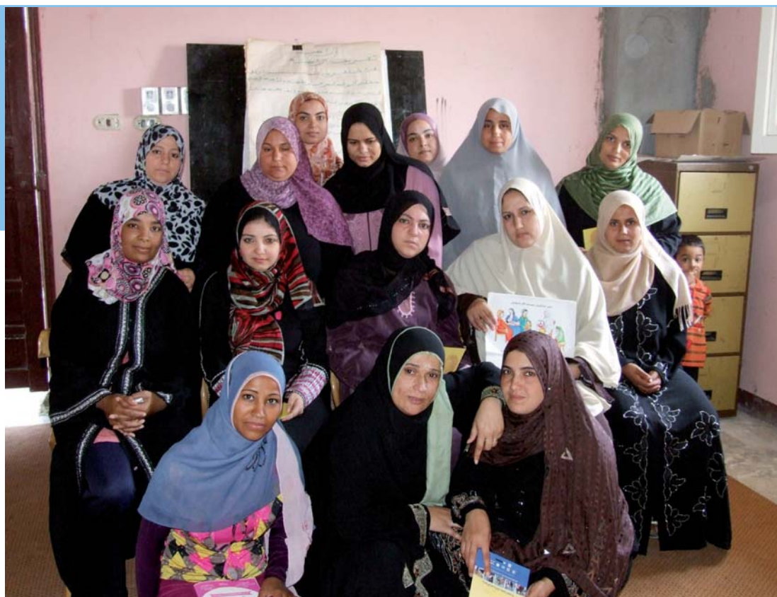
Governorate of Ismailia, 2010, ©

Local families designated 120 girls for an intensive six-month training as development leaders: this included literacy, health, human rights, income-generation and administrative and communication skills. After training, the girls returned to Abu-Ashur to work with family members on a tailored, customized basis.