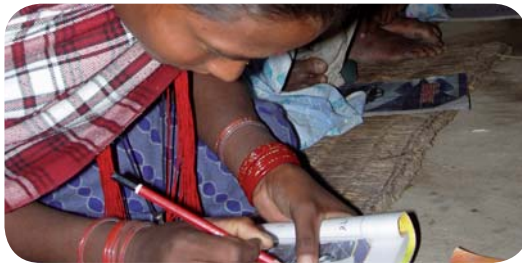
The Non-Formal Education Centre in Nepal.