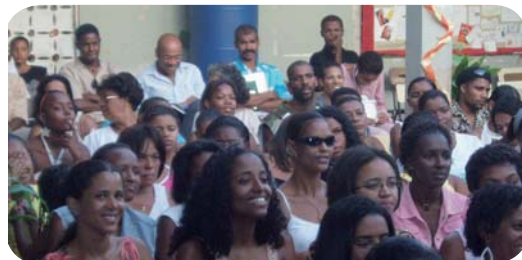
Direction Générale de l'Éducation et la Formation des Adultes, 2010, ©