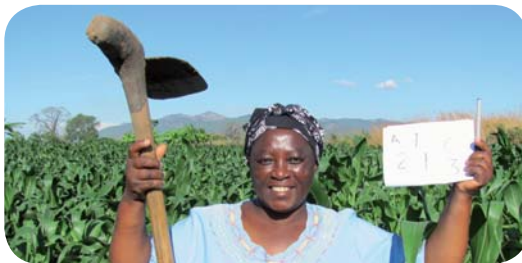
COWFA, 2010, ©