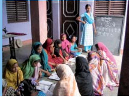
Non-Formal Education Centre, 2010. ©

The adults and adolescents' programme has been designed for a very wide age-group from 15 to 45 years and was launched immediately after democracy was established in 2006. It is geared to people who have not been to school. Classes consist of at least 20 adults. Lessons are two hours long and are held six days per week. The purpose is not merely to learn to read and write in Nepali but also to deal with problems that anyone may encounter in daily life. It aims to teach democratic principles and to provide tools to enable people to engage in economic activity.