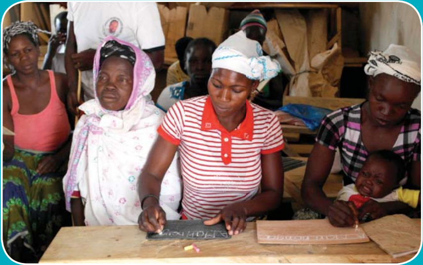
Literacy session, Burkina Faso