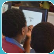
SOUTH AFRICA & USA