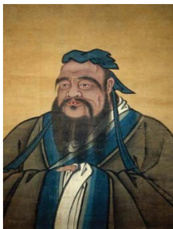
Confucius Cultural Week for Confucius

An International Jury appointed by UNESCO's Director-General meets in Paris once a year to select the prizewinners. The Jury is made up of high profile practitioners and academics in the field of education, who are appointed for a period of three years. Candidatures for the prizes are submitted by Member States or by international non-governmental organizations in official partnership with UNESCO. The Jury is presently composed of five experts representing UNESCO's geographical distribution.