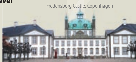
Fredensborg Castle, Copenhagen