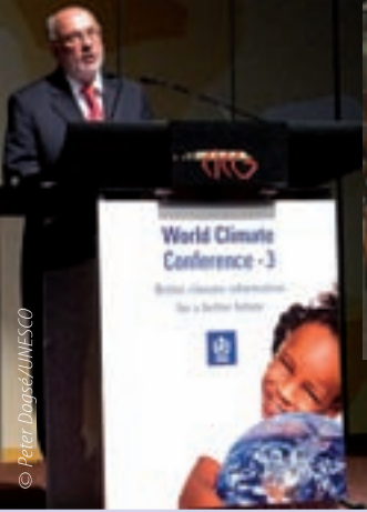
UNESCO ADG/SC speaking at World Climate Conference-3 on 31 August 2009.