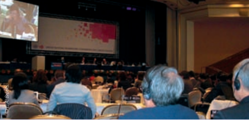
UNFCCC Negotiations in Bonn 2009

The United Nations System determined that the overwhelming importance of addressing global climate change requires the concerted efforts of the entire System because there is increasing concern that climate change and climate variability could undermine the attainment of the Millennium Development Goals. It therefore worked through the Chief Executives Board to determine a course of action outlined in The UN System Delivering as One on Climate Change. Here, five focus areas and four cross-cutting areas were established, to be led by co-convening agencies: