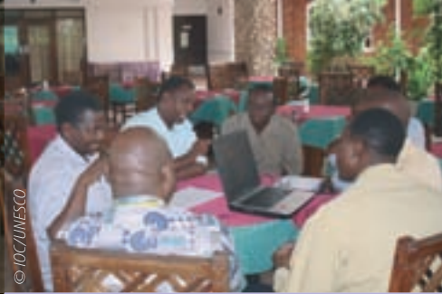
Working groups at the regional Bid Writing workshop held in Mombasa, Kenya began the development of the proposal at this meeting.