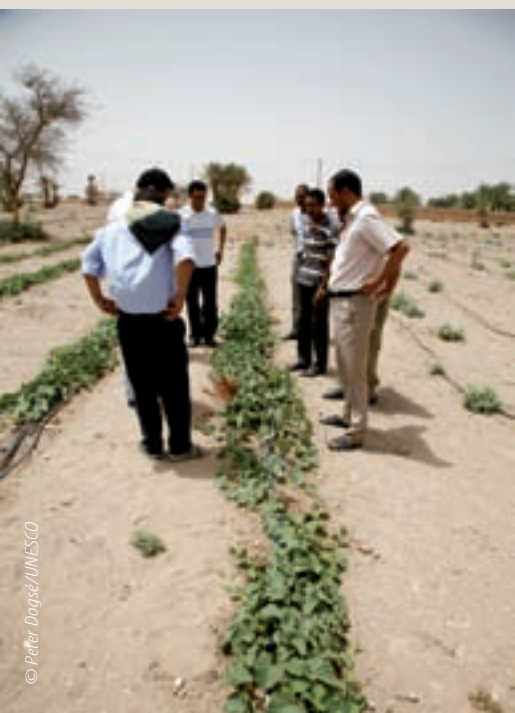
Adaptation by drip irrigation in Morocco

In Asia, programmes such as Biosphere Reserves for Environmental and Economic Security and Shoring Up for Climate Change, a mangrove restoration and rehabilitation through carbon offsets programme, will provide on-the-ground support to governments and communities to seek sustainable natural resource use.