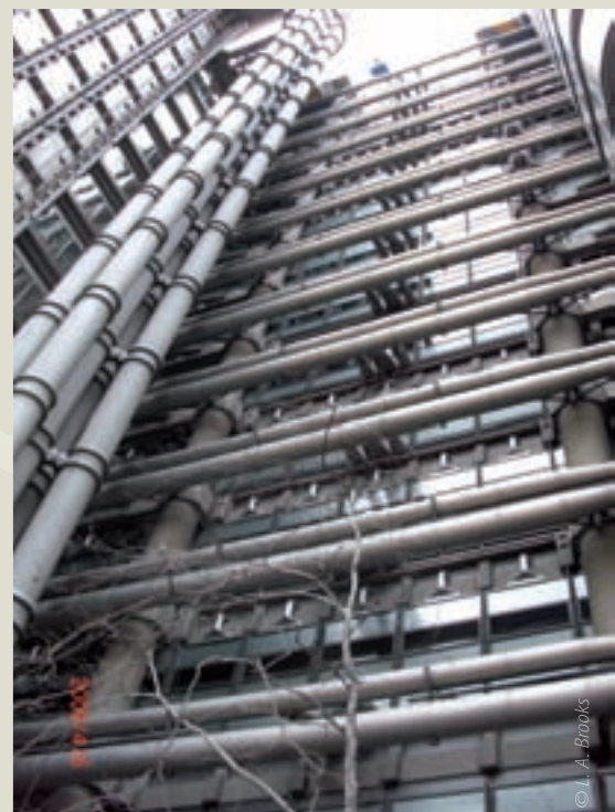
The Carbon Exchange in London.

In line with this future outcome UNESCO will undertake efforts to reduce greenhouse emissions, and analyze cost implications of purchasing carbon offsets and proposing UNESCO projects and sites for receipt of such offsets on the basis of ethical, economic and scientific validity. An Emissions Reduction Strategy will be based on a comprehensive Climate Neutral Policy including the implementation from 2010 of an Environmental Management System in line with UN requirements and as called for in UNESCO's own Green Audit.