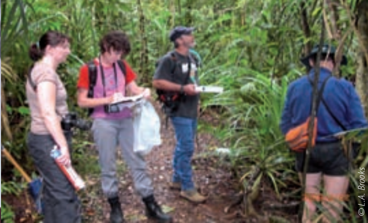
Biologists conducting the 2009 Mycoblizt in the Atherton Tablelands, Queensland.