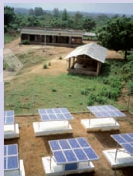
A rural solar installation powering a health centre and a school in Towé, Benin.