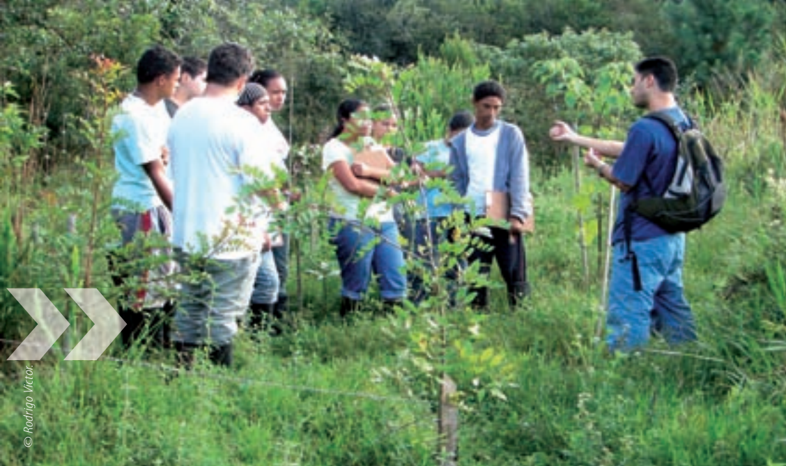
Green jobs and carbon sequestration –win-win forest restoration in the São Paulo City Greenbelt portion of Mata Atlântica Biosphere Reserve.