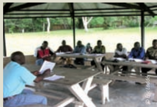
UNESCO-sponsored programme in the Réserve de Faune à Okapis, Democratic Republic of Congo, to teach ecology to park guards and students.