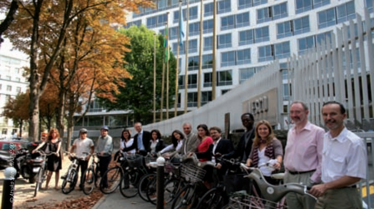
UNESCO staff demonstrate the carbon-neutral way to commute, including with Paris' Velib rental bike programme.