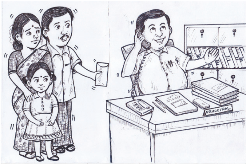
Illustration 2: School admission