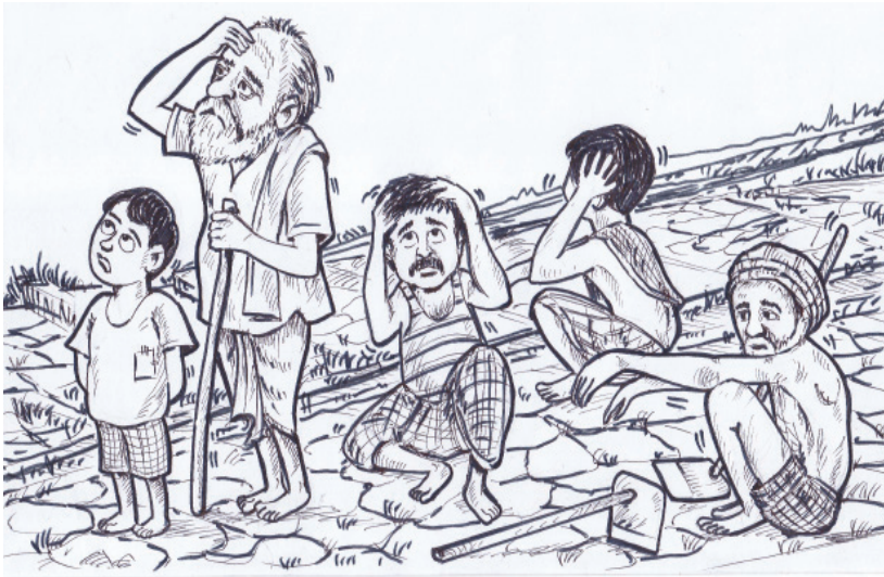
Illustration 4: Support for agriculture

Q: If funds for a new canal system were allocated to divert water to assist farmers in their cultivation, does a person have the right to find out why the canal was not built and what the funds were used for?