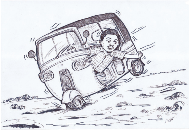
Illustration 1: Poor quality roads

Q: Does a person have a right to question what happened to the money allocated to repair the road in his or her town?