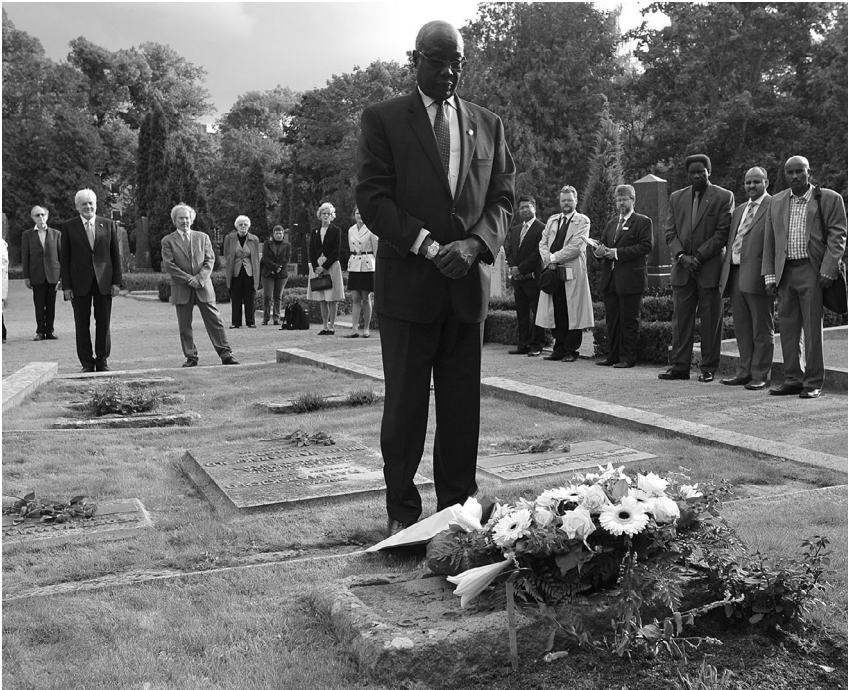
Laying a wreath at Dag Hammarskjöld's Grave