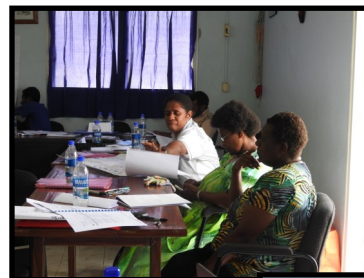
Professional standards for school principals in Santo, Vanuatu

The Ministry of Education in Fiji has completed their work on the teacher competency framework and organised capacity building workshops for teachers to ensure country wide coverage of the competency standards. In Samoa work is continuing on establishing a set of professional standards for teachers with responsibilities. Two workshops will be organised in November 2015 to provide information to teachers on how to use these standards to improve their practice. Three capacity building workshops have been completed in Vanuatu in three different provinces. The last two workshops will be held for Penama and Malampa provinces later in November. The School Based Management team in Vanuatu is collaborating with UNESCO Apia on a small research project to determine the impact of professional standards on principal practice in schools. A three day workshop is being planned in collaboration with the Solomon Islands National University to familiarize their lecturers with the teacher education modules prior to the in-service workshops which are scheduled to begin in late November 2015.