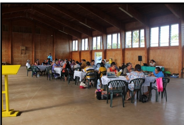
Group discussion Tuvalu workshop

In Tonga workshops were organized by the Ministry of Education and Training in partnership with UNESCO on how to incorporate ESD elements such as culture, healthy lifestyles, sustainable livelihood and climate change where appropriate into the secondary school curriculum. The Ministry of Education and Training believe that ESD is the best vehicle to prepare people to live in an increasingly changing, complex, diverse and globalized world as "ESD will enrich the quality of education we endeavour to deliver in Tonga. It is transformative and will make quality wider and more important for our living sustainably in the future" (Tonga Deputy Chief Executive Officer (CEO) for Quality Assurance and National Coordinator for EFA/ESD/EIU/ASPnet).