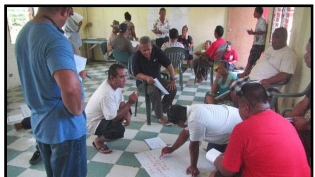
Community members working in groups

The final report is expected on 10 th November 2015.