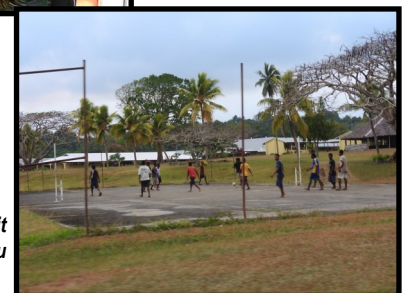
Matavule school visit Santo, Vanuatu