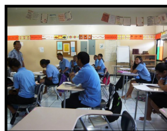
Vocabulary book trial, Palau

Our Australian Contractors are currently rewriting four of the teacher education modules for UNESCO and these are to be completed by the end of 2015 due to additional funding given by UNESCO Paris. EQAP will contract them to rewrite the final modules. The style and format of the modules was agreed on by UNESCO and EQAP in collaboration with the contractors at the meeting in Fiji in June 2015. The first two modules that were already completed will be edited to conform to the agreed standards by the contractors.