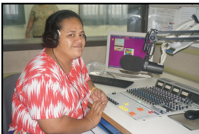
One of the Journalists with the Tuvalu Media department