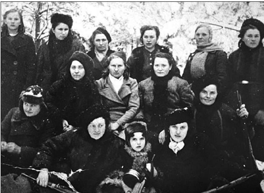
Female Jewish resistance fighters in the forests near Pinsk, c. 1943