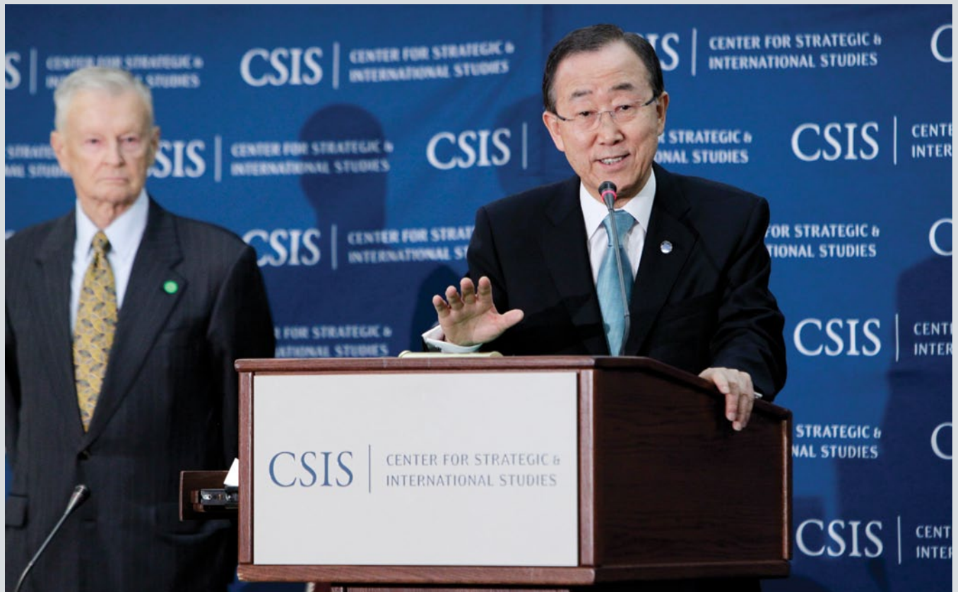
Washington D.C., 7 May 2012: Secretary-General Ban Ki-moon and Zbigniew Brzezinski, former United States National Security Advisor and CSIS Counselor. To read the full speech, visit: www.un.org/en/peacebuilding/pbso/pdf/Secretary-General-CSIS-7May12.pdf

To showcase progress and challenges in peacebuilding to a global audience, the Secretary-General delivered a keynote speech on peacebuilding at the Center for Strategic and International Studies (CSIS) in Washington D.C. The event highlighted the evolving nature of peacebuilding and critical role of national ownership and leadership in the process of building a sustainable peace.