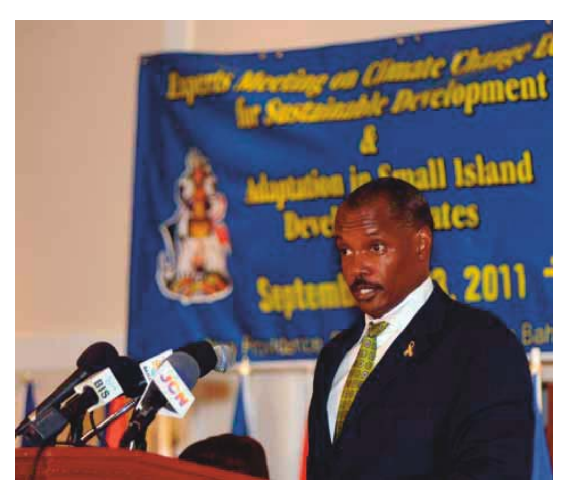
Desmond Bannister Minister of Education, The Commonwealth of the Bahamas

'... teachers are the best channels of knowledge in our world and therefore we must equip them with the knowledge and confidence to lead in this global mission... less today means more for the future.'